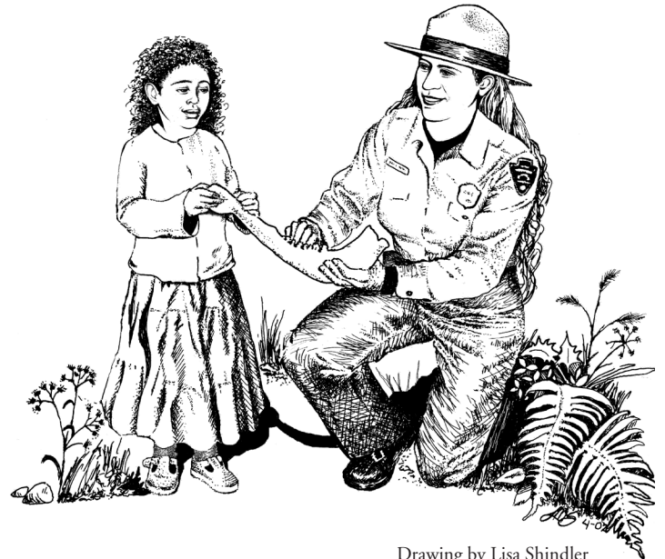
Drawing by Lisa Shindler

The orientation program, exhibits, Discovery Room and Visitor Center scavenger hunt are great ways to learn more about Olympic National Park. Nearby trails provide access to a living classroom. To plan a class visit or rent a traveling trunk full of park-related materials and activities, call the park's education coordinator at (360) 565-3146. Depending on availability, a park ranger may be able to assist with your visit.