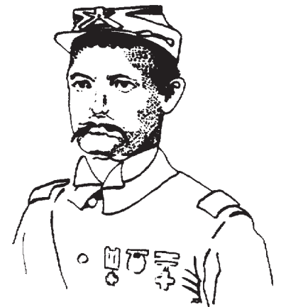
Lt. Joseph P. O'Neil

The fame of being the first to cross the Olympics went to the 1889-90 Press Party. Financed by the Seattle Press , the well-publicized expedition crossed via the Elwha and Quinault Valleys, a six-month ordeal during one of the worst winters in history. A month after the Press Party emerged from the mountains, Lt. O'Neil began his second expedition. He and his men explored the eastern and southern Olympics between Hood Canal and the Pacific. The area inspired him to advocate establishment of a national park.