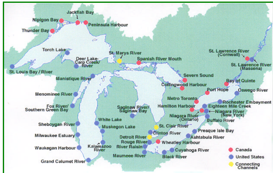
Figure 1: Forty-Three Areas of Concern

Toxic sediments is one of the major issues affecting all U.S. and shared areas of concern. While costs of remediating toxic sediments vary widely, it can cost on average $5.6 million to remediate sediments in one area of concern. In addition, Superfund sites impact about half (22 of 31) of the areas of concern, further complicating the issues being addressed. See exhibit 3 for a detailed table on the status of RAPs.