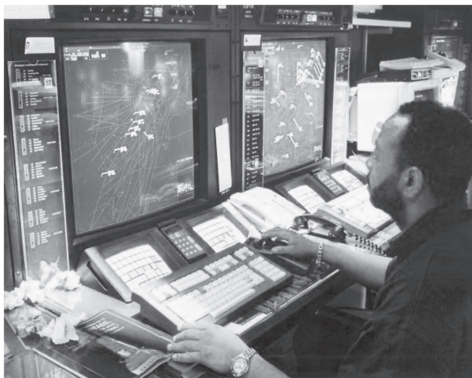
Figure 3: Air Traffic Controller

controller workforce plan. 8 The agency attributes this reduction in training time to improved training and scheduling processes and increased use of simulators. However, as of May 2008, about 2,700 controllers were in trainee status, and it is too early to tell how the length of their training will be affected by factors discussed previously in this statement, such as the decreasing proportion of fully certified controllers available to provide on-the-job training.