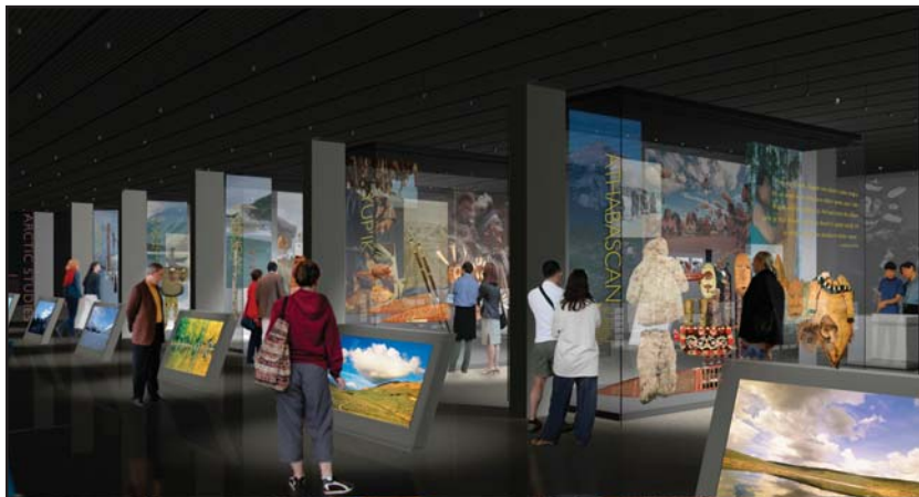
Prospective view of the new gallery at the Anchorage Museum of History and Art, which will feature Smithsonian Alaska collections.

Alaska Collections Project (ACP), which over the past five years (since 2000) has engaged several museum curators and over 50 Alaska cultural experts (Native Elders, community leaders, artists, and educators) in the cultural and linguistic documentation of many hundreds of objects. The initial results of this project may be viewed at arctic.si.edu .