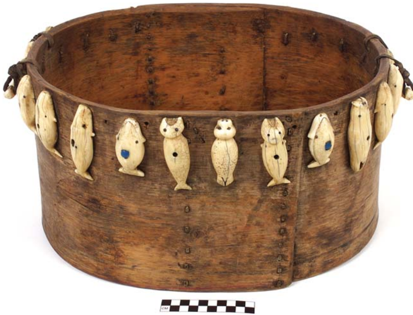
Iñupiaq bowl from Wales, Alaska.

Change (SEARCH) interagency program and to the forthcoming IPY 2007–2008 outreach activities. This exhibit will be open for nine months, until November 2006.