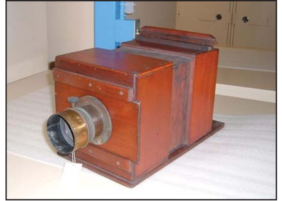
Early camera (around 1880) that used glass plate negatives. All photographs from the First International Polar Year, 1881–1883, were taken by such equipment.

The Smithsonian offers its Arctic and Antarctic collections—ethnological, botanical, zoological, mineral, films and archival materials, etc.—to scholars for all types of IPY research. Of particular value are the early ethnological and biological collections from Barrow, Alaska (1881–1883), and Ellesmere Island (1881–1884), from the first IPY era, as well as the scientific instrument collections and records of the early IPY stations. The Smithsonian thus aims at becoming a key IPY inter-agency hub for education, outreach, and public programs during 2007–2009 through its museum, outreach, and exhibit ventures.