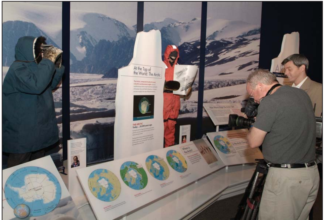
Opening section of the new Smithsonian exhibit, Arctic: A Friend Acting Strangely (April 2006).

The first Smithsonian contribution to the forthcoming IPY is a new exhibit, Arctic: A Friend Acting Strangely , which opened in April 2006. Under development since 2003, the 1800-square-foot exhibit is the first and so far the only governmental outreach and educational venture that brings the issues of Arctic climate change and environmental research to the general public. It has been developed jointly by the ASC and the NMNH Office of Exhibits in collaboration with NOAA, NASA, and NSF, as the main Smithsonian contribution to the Study of Environmental Arctic