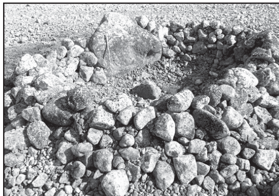
Saami sacrificial structure on the island of Stora Fjäderägg in northern Sweden.

funding for the symposium was granted by the NSF Office of Polar Programs, the Social Sciences and Humanities Research Council of Canada, Centre Interuniversitaire d'Études et de Recherches Autochtones, the Government of Nunavut, the Greenland Home Rule Government, and other agencies. The proceedings of the symposium were published in 2005 as a special issue of the journal Études/Inuit/Studies titled Preserving Language and Knowledge of the North .