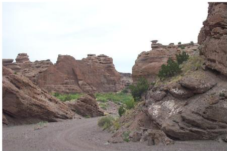
SAN LORENZO CANYON