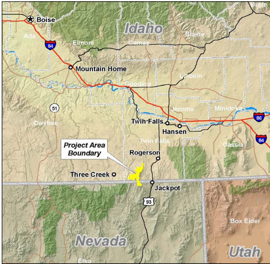
China Mountain Project Area Vicinity

Bureau of Land Management Jaridge Field Office 2536 Kimberly Road Twin Falls, ID 83301