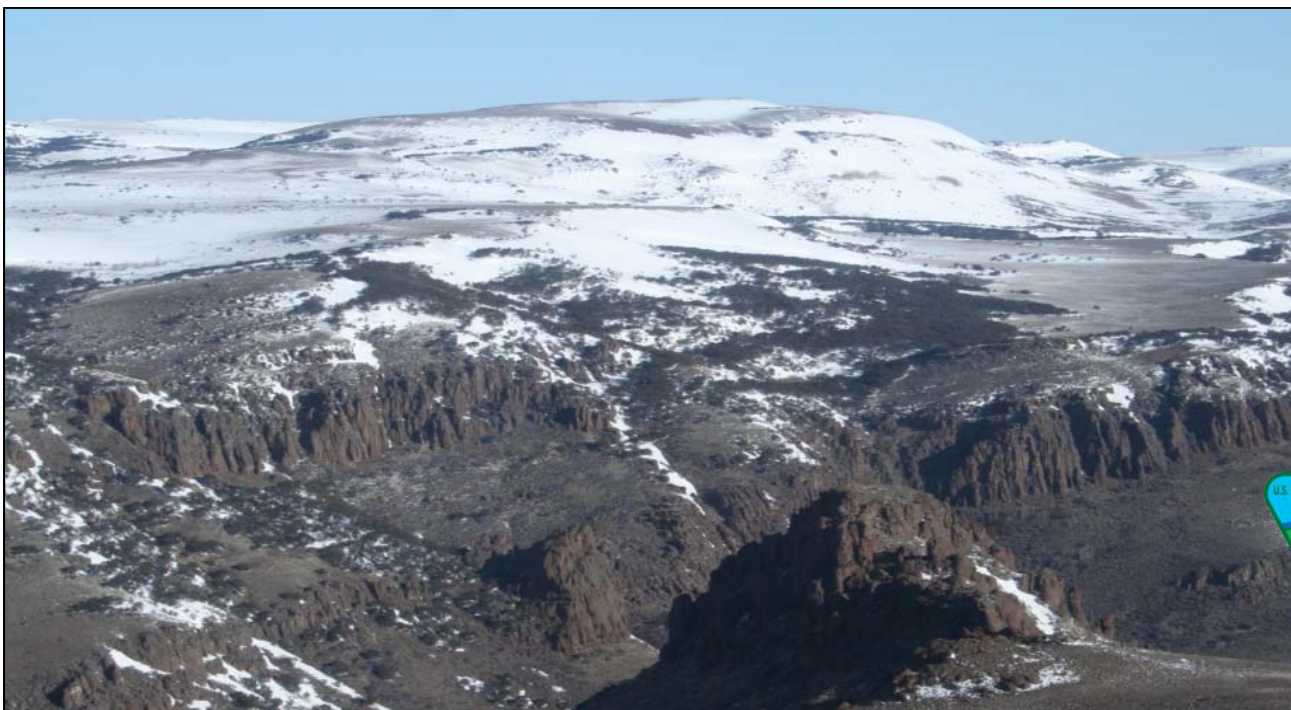
View Northwest from the Nevada/Idaho State Line.

The proposed project area includes: approximately 15,300 acres of public land administered by the BLM Twin Falls District, Jarbidge Field Office; 4,700 acres of public lands administered by BLM Elko District, Wells Field Office; 2,000 acres of land managed by the State of Idaho; and 8,700 acres of private land in Idaho. The exact location of the proposed wind turbines, roads, and transmission interconnect line(s) to be analyzed in the EIS will be finalized once wind resource data analyses have been completed, project area construction constraints have been determined (refined contour data and soils analysis), and the BLM identifies the location of sensitive cultural, tribal, or environmental resources, if any, that are to be avoided.