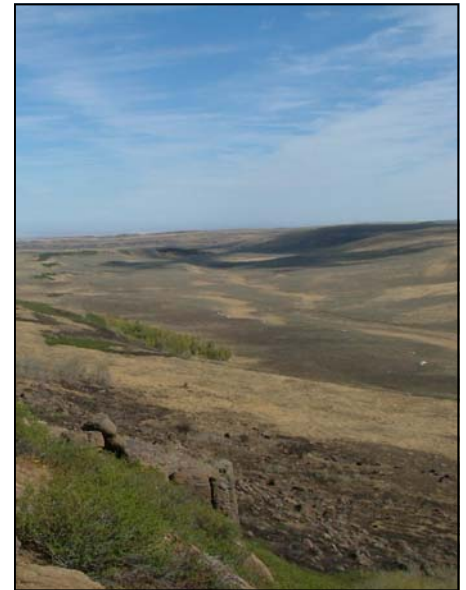
Typical View within the Project Area

The EIS will analyze the potential environmental impacts of the China Mountain Wind Power project. The EIS process will comply with the Federal Land Policy and Management Act of 1976 (FLPMA) and the National Environmental Policy Act of 1969 (NEPA). The BLM will work closely with interested parties to identify the management decision that is best suited to the needs of the public. This collaborative process will take into account local, regional, and national needs and concerns.