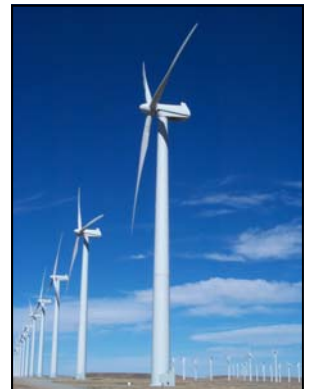
Foot Creek Wind Power Project, Arlington, WY

Project Manager China Mountain Wind Power Project EIS Bureau of Land Management Jarbidge Field Office 2536 Kimberly Road Twin Falls, Idaho 83301