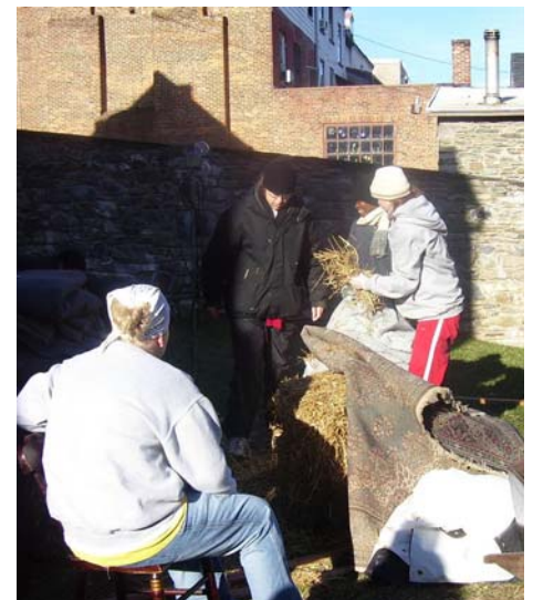
Shepherd University students stuff mattresses with straw for a new African American living history exhibit.

The park extends thanks and gratitude to this group for working hard on their day off.