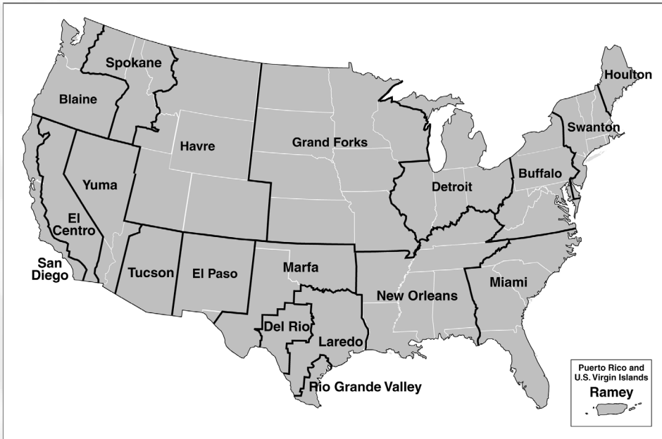
Figure 1: U.S. Border Patrol Sectors