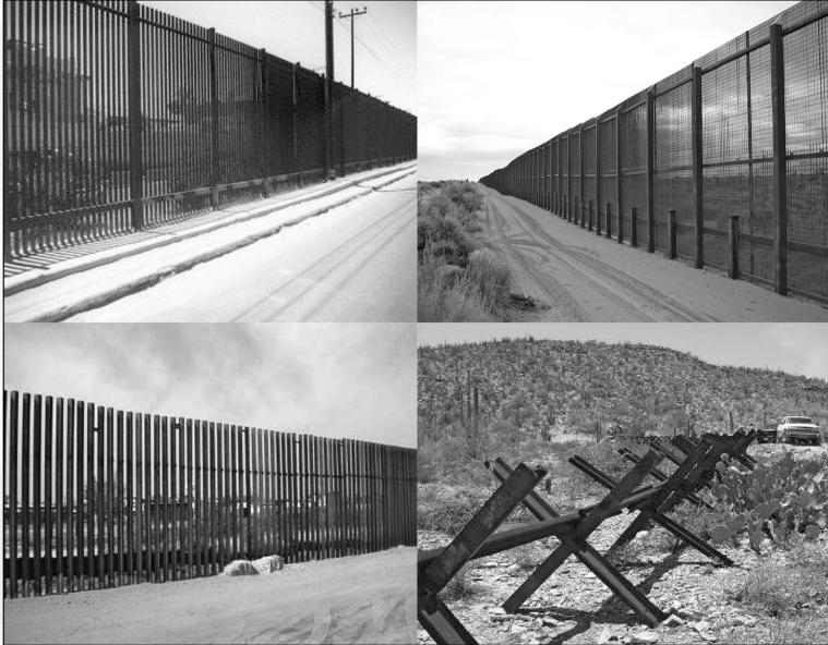
Figure 3: Examples of Fencing Styles along the Southwest Border