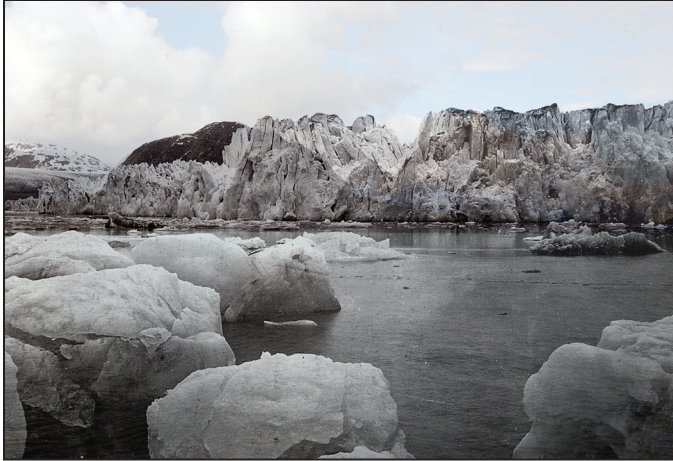
Figure 2. Intermediate step of the Microsoft® PowerPoint® dissolve out custom animation of the Before Photo revealing the underlying After Photo. After Photo: Muir Inlet, Glacier Bay National Park, Alaska.