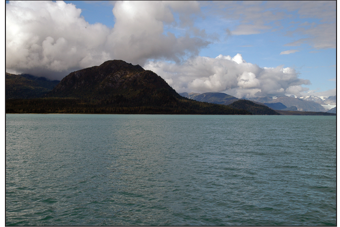
Figure 4. Final step of the Microsoft® PowerPoint® dissolve out custom animation revealing the After Photo.

The animated photo pairs succinctly present more than 100 years of complex physiographic and ecosystem changes in a 10 second video clip. This project produced eight animations of the glacier photo pairs taken in Glacier Bay National Park.