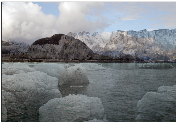
Figure 3. Intermediate step of the Microsoft® PowerPoint® dissolve out custom animation of the Before Photo revealing the underlying After Photo.