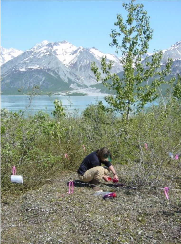
Deploying bear attractant scent at a hair trap in Tarr Inlet.

At each study site we also deployed at least one bear hair trap, a triangle of knee-high barbed wire strung around a pile of sticks or rocks on which a steamy quart of rancid cow's blood and fish oil was poured each visit. Bears were lured into the traps by the enticing scent and left clumps of fur on the barbs, which can be genetically analyzed for species, sex, and individual identification. Results from this analysis will indicate how many different bears have used the area between our visits. Hair traps were placed far off the beach and in thick scrub where people are unlikely to be walking. Bear hair was also collected opportunistically from rub trees, trails and beds.