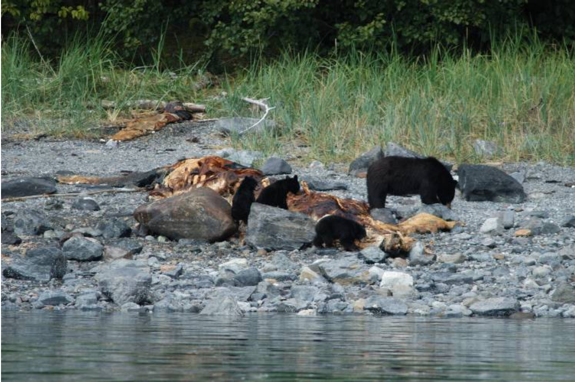
A female black bear with three cubs feeds on a humpback whale carcass on Strawberry Island.

risk factors for bear encounters. Researchers surveyed 120 beaches for signs of bear use and conducted risk assessments at 162 campsites. At each site they recorded bear sign and bear habitat potential along with other site characteristics thought to be predictive of the likelihood of a bear encounter.