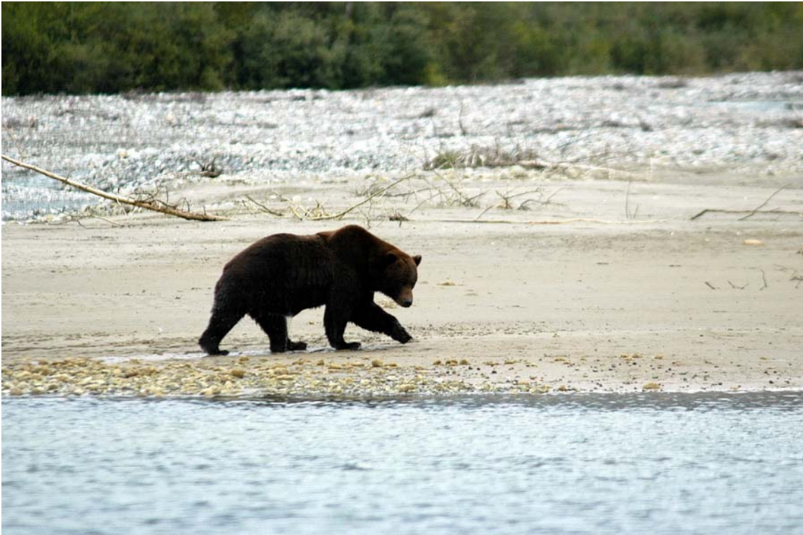
Brown bear in Tidal Inlet

In Glacier Bay National Park encounters between kayakers and black and brown bears are of great concern, both because of potential threat to human safety as well as potential displacement of bears from important seasonal habitats. Little is known about the black and brown bears in GLBA, and as a result it has been difficult to evaluate seasonally important habitats in relation to their importance to bears. In order to evaluate current camping closure areas as well as potentially important foraging areas within the park, managers need information regarding how bears use specific sites.