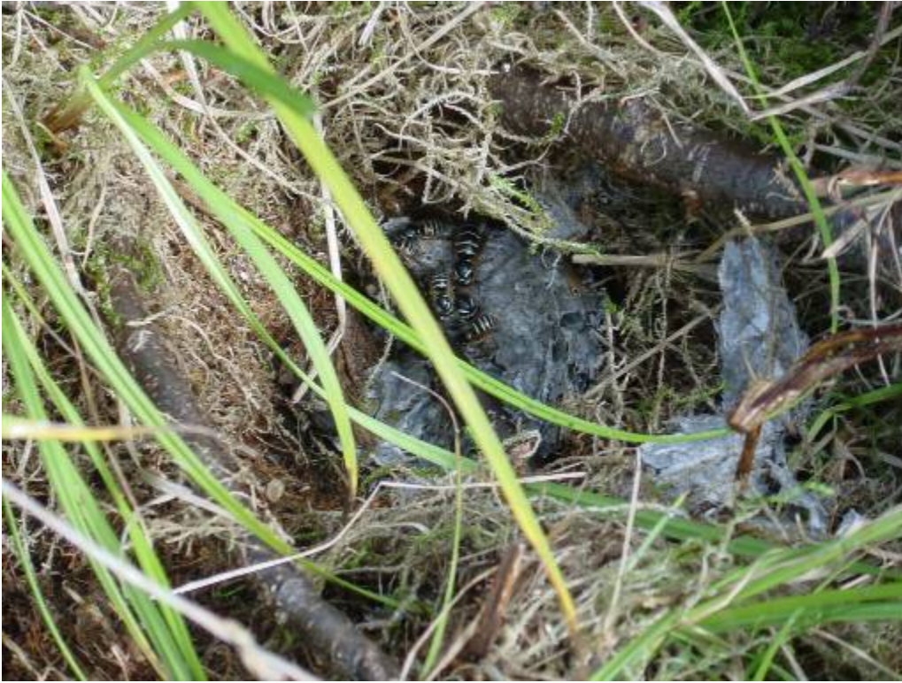
Remains of wasp nest in Russell Passage.

We also saw bumble bee parts in many scats in smaller quantities. We found hair and body parts of what we suspect to be bear, in scats in two different locations. Otherwise it looked as if bears were eating the usual assortment of berries, grasses, herbs, and barnacles. The pink salmon runs seemed late and small: streams that we have seen teeming with pink salmon in July of past years had only a few fish by the end of August this year. We found only a handful of scavenged fish and scats containing fish parts in all our study areas.