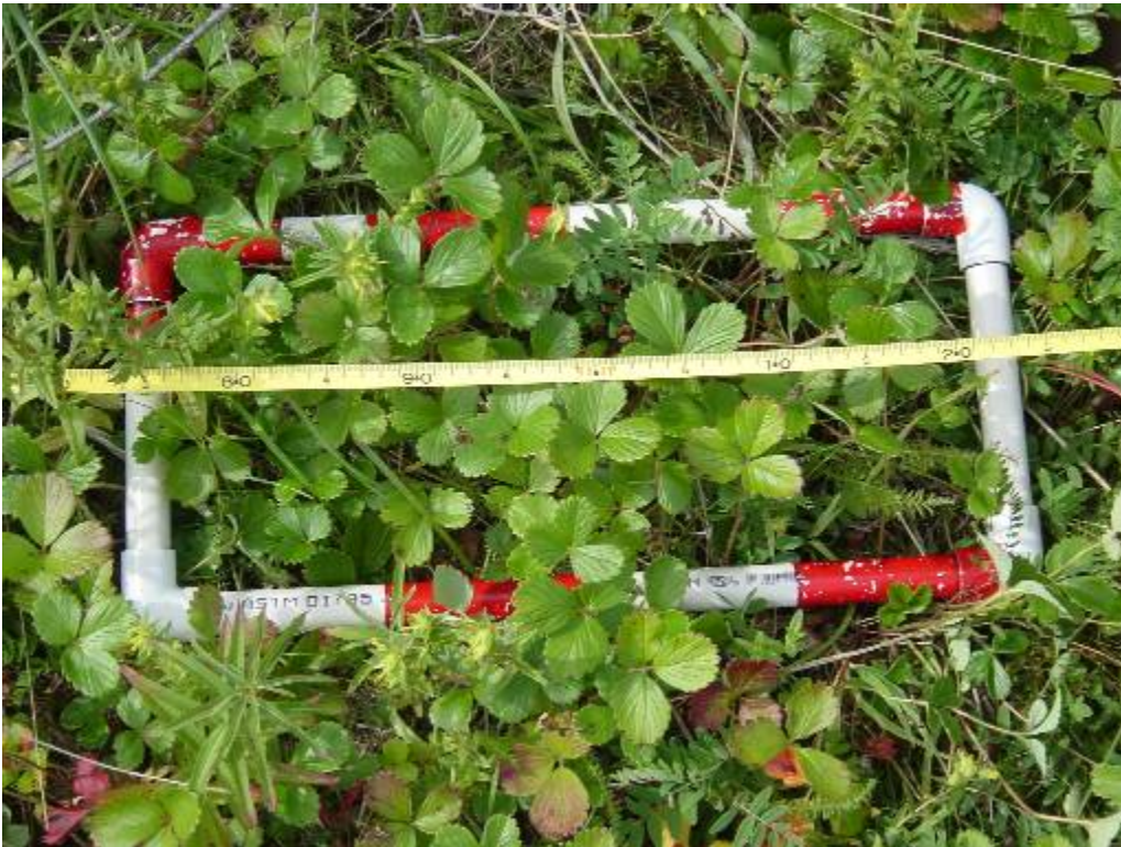
Vegetation plot along a transect line in a “mixed herb” habitat zone.

In each study area, we delineated the boundaries of different habitat zones, and then ran transects through each zone on which we randomly placed a small rectangle to determine our plot. In each plot we estimated the percent cover of each plant species and counted the number of berries on berry producing plants. Data from these plots gives us an average percent cover of each plant in the area and an overall characterization of the habitat zone.