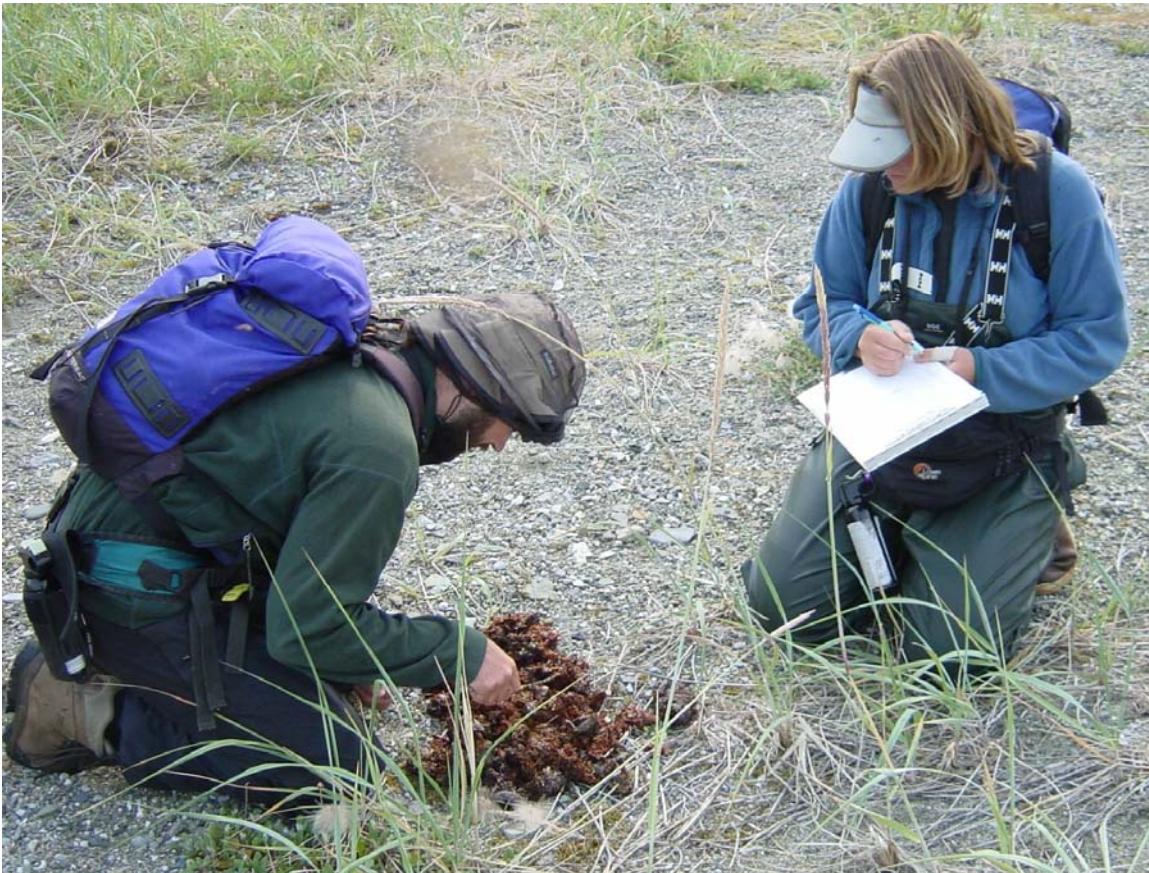
Examining the contents of bear scat (otherwise known as “poking the poop”).

In order to find out what foods bear are targeting, we examined each scat we found for contents. Scats that were too complex to examine in the field were collected and later sieved for more detailed analysis. In order to determine the relative importance of each plant species to bears, plants that were observed or known to be bear foods were collected from each study area for nutritional analysis. Other bear foods such as barnacles, mussels, and spawning salmon were also collected opportunistically. A number of these bear food samples will also be sent off for stable isotope analysis to determine the carbon and nitrogen signature of each food source. This can be compared to stable isotope analysis of bear hair to determine the percentage of marine versus terrestrial foods that bears in each study area are consuming.