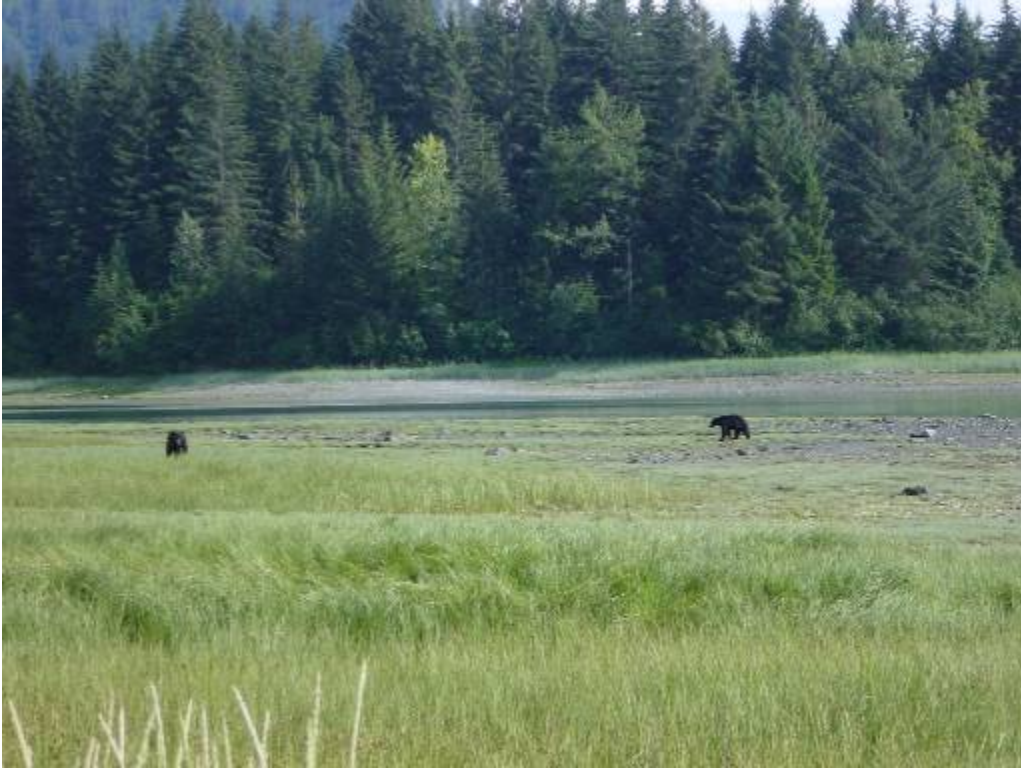
Two black bears interact in South Sandy Cove.

Preliminary analysis of data from 2004 will occur this winter. The summer of 2005 will be the second and final season of field work, after which the data will be analyzed and a final report to the Park will be written.