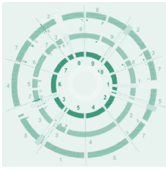
Syntenic map of various Brassica species with Arabidopsis in the center