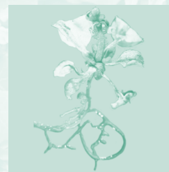
An LRRP mutant of Arabidopsis

These unanticipated discoveries have opened a new world of experimentation and understanding that we must explore now.