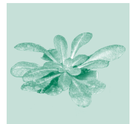
Arabidopsis plant in its vegetative state