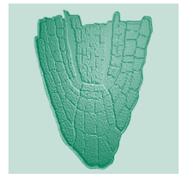
Cross section of an Arabidopsis root