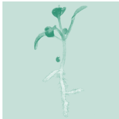
A young Arabidopsis seedling

of biological information on gene function, plant form and plant biochemistry. The eventual goal would be assembly of a virtual plant—click on a leaf at three days of age and get a list of all genes up-regulated in a variety of physiological conditions; click on a root and watch it grow with a dynamic list of changes at the molecular level accessible. Thus, the data would be accessible to all researchers in an easily utilized form.