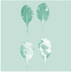
Arabidopsis leaves from normal (susceptible) and mutant (resistant) plants