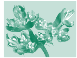
Flowers from an Ap1 Arabidopsis plant