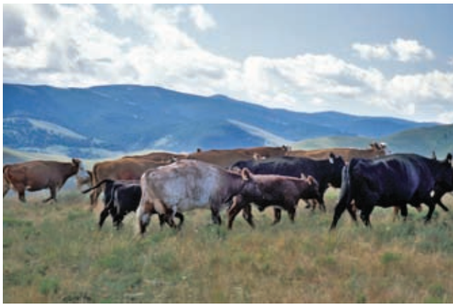
Domestic livestock grazing