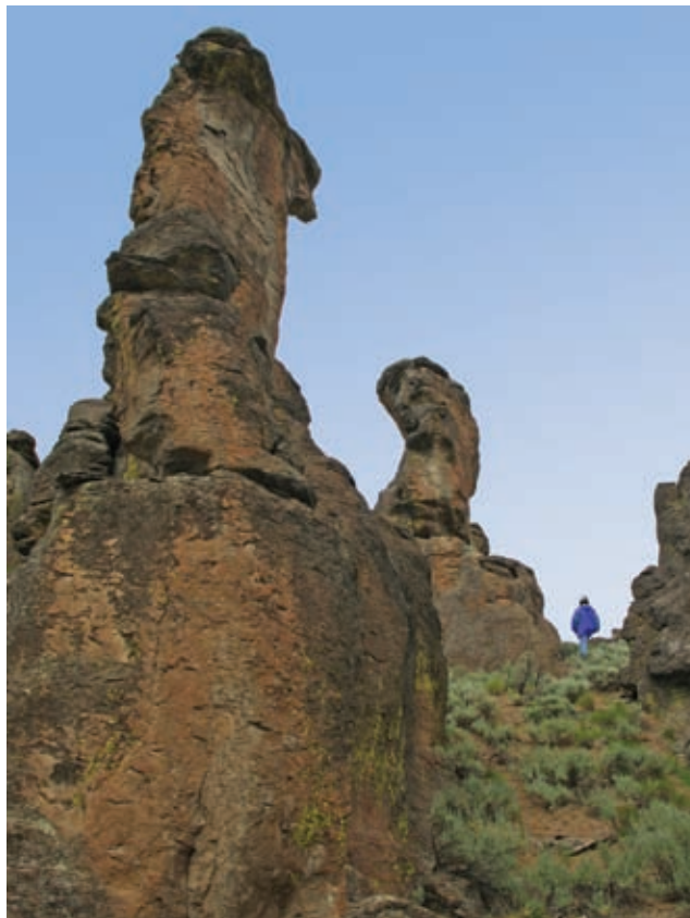
Gooding City of Rocks WSA, BLM Shoshone Field Office