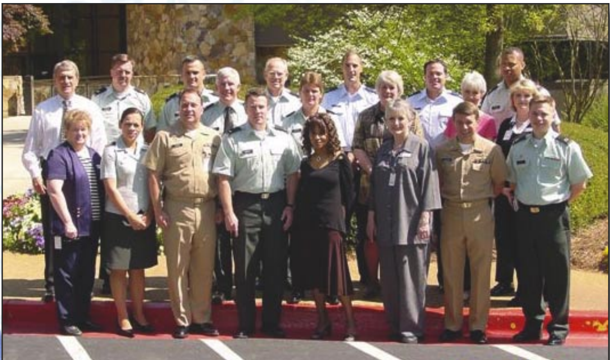
These new Reserve Force Officers (RFOs) underwent several days of training in Atlanta, GA, in April 2004.

The Phase II Program features a redesigned Professional Development Course (PDC) detailing state director and RFO mobilization responsibilities. Using multimedia presentations, the PDC incorporates the three most likely mobilization scenarios faced by the Agency, emergency mobilization, time-phased response mobilization, or healthcare draft. RFOs completing the PDC undergo an RFO Certification Examination to test their mastery of the training materials presented.