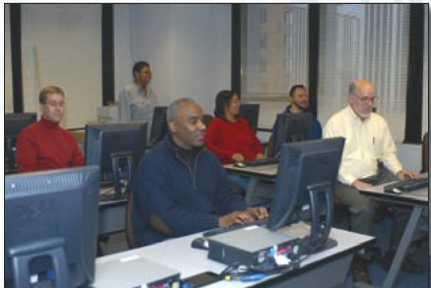
Personnel at Selective Service national headquarters enhance their computer skills in the new classroom facility

With the influx of new IT talent, a sharper focus on leveraging limited resources, and a better plan for integrating system and processes using off-the-shelf technology, the IT staff took the first major steps towards revitalizing and recapitalizing the Agency's IT infrastructure.