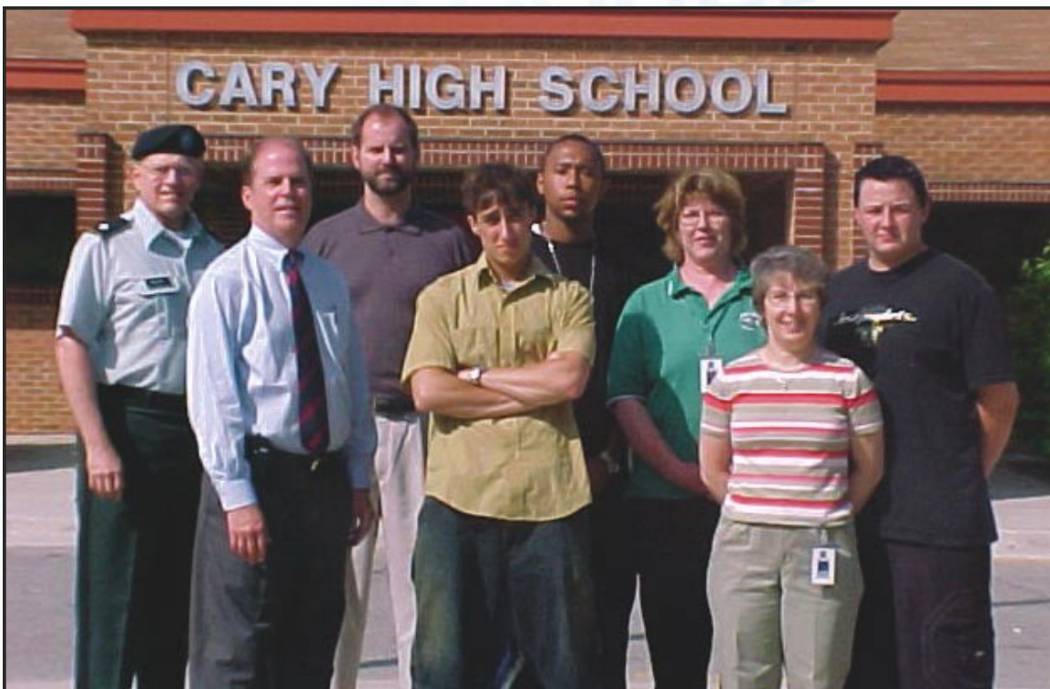
Students at Cary High School in Cary, NC, pictured here with faculty advisors and local SSS representatives, produced a video on registration with Selective Service that won first place in the "Responsibility" category of an area high school competition.

The Selective Service goal is registration, not prosecution. However, if a man fails to register or prove that he is exempt from the registration requirement after receiving SSS mailings, his name is referred to the U.S. Department of Justice (DoJ) for investigation and possible prosecution. During FY 2004, more than 162,000 names and addresses of non-registrants were forwarded to DoJ.