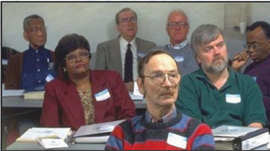
More than 11,000 local board members, all volunteers, sharpen their skills with periodic training.

The Agency's workforce is largely comprised of its local, district, and National Appeal Board members. The men and women serving on these boards are uncompensated citizen volunteers. They may be found in virtually every American community. Local board members are