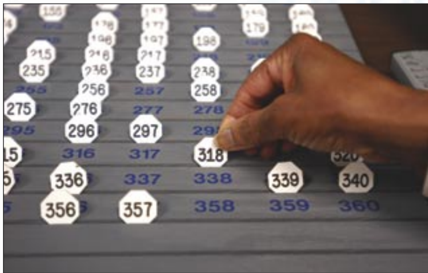
Periodic lottery drills, matching birth dates to numbers in random drawings, keep Selective Service prepared for a national emergency.

The Alternative Service Division began developing Memoranda of Understanding (MOU) with civilian corporations and