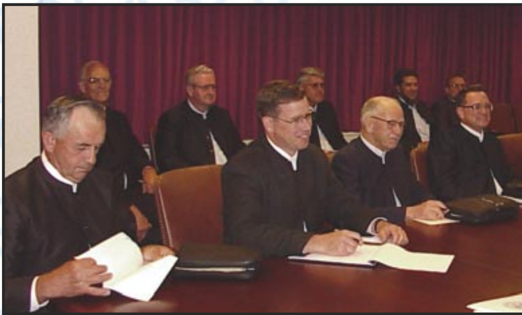
Selective Service hosts representatives of pacifist denominations.

Also, the Agency obtained increased cooperation from new Selective Service registrars for the Farmworkers Opportunity Program and the Workforce Investment Act (WIA) Program. The result was increased registration awareness and compliance by registration-age men participating in these programs. Increased use of on-line registrant verification resulted in improved customer service by providing high school registrars, registrants, student financial aid officers, and WIA officials with the ability to verify a man's registration.