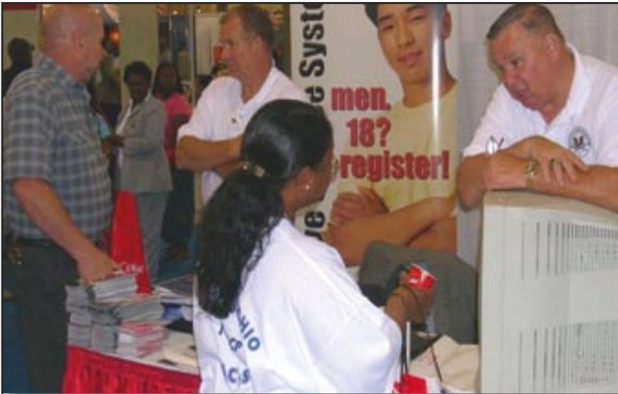
Selective Service professional staff and volunteers also communicate with the mothers and sisters of young men to stress the importance of registration.

Los Angeles (CA) Times, Des Moines (IA) Register, Sacramento (CA) Bee, San Jose (CA) Mercury-News, San Diego (CA) Union-Leader, Orange County (CA) Register, Lincoln (NE) Journal-Star, Riverside (CA) Press-Enterprise, Cleveland (OH) Plain Dealer, Tampa (FL) Tribune, Minneapolis (MN) Star-Tribune, St. Louis (MO) Post-Dispatch, Wilmington (NC) Star-News, Philadelphia (PA) Inquirer, Chicago (IL) Daily Herald, Las Vegas (NV) Review Journal, Seattle (WA) Post-Intelligencer, Denver (CO) Post, Atlanta (GA) Journal-Constitution, Dallas (TX) Morning News, West Patterson (NJ) Herald-News, Albany