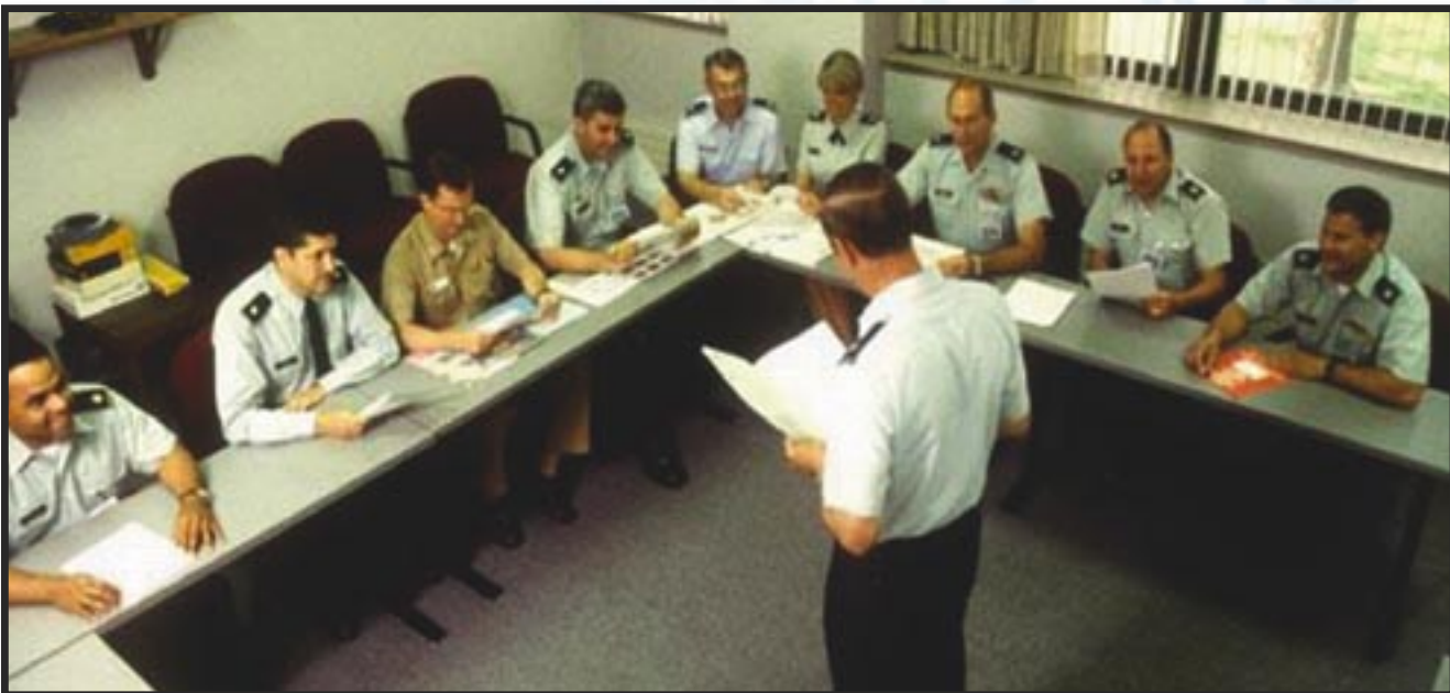
Reserve Force Officers (RFOs) play an important role in Selective Service's readiness and training activities.

In FY 2003, Selective Service reduced its active-duty officers from eight to two, and in FY 2004, those two active-duty officers departed the Agency. The elimination of these active-duty officers completed the Agency's active duty military workforce restructuring plan submitted to the Office of Management and Budget.