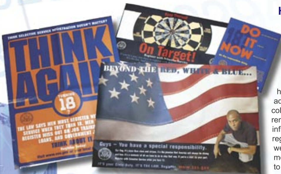
SSS High School Kit for FY 2004

Last fall SSS distributed its FY 2004 High School Publicity Kit to over 32,000 high school Selective Service registrars and principals. The kit has an array of communication items -- posters, high school newspaper ads, public address announcements, and other collateral publicity materials that remind both young men and their influencers about the importance of registration compliance. Educators were encouraged to remind young men about their civic responsibility to register and the importance of complying with federal laws.