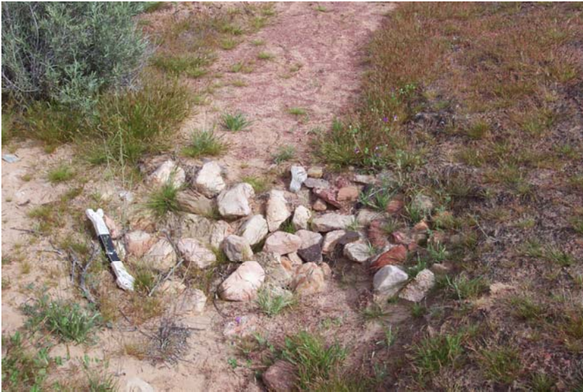
Photo noting approximately 30cm of sediment deposited behind the check.

Close up and overview of gully with checkdams.