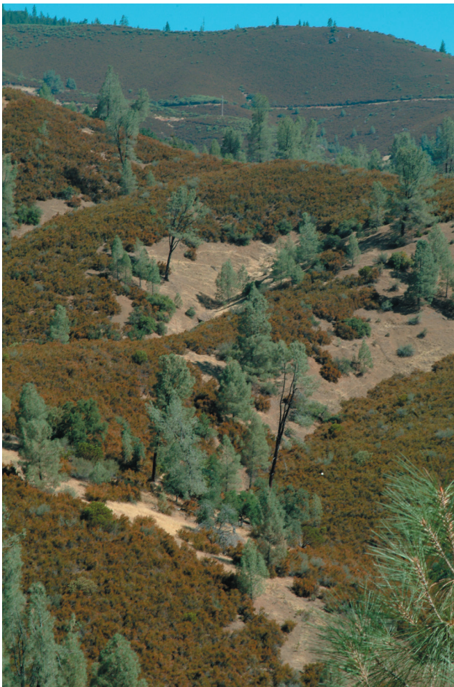
Typical mosaic of chaparral and foothill pine in California foothills.

Foothill, or gray pine ( Pinus sabiniana ) is widespread throughout the interior foothills of central and northern California, often occurring in a mosaic of vegetation patterns with chaparral and grassland.