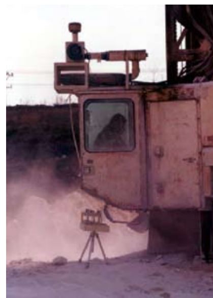
Figure 1. Cab filtration and pressurization systems prevent dust from penetrating cabs.

NIOSH has conducted studies of mining in the United States in cooperation with the Mine Safety and Health Administration (MSHA), mine operators, and equipment manufacturers to find the most cost-effective ways