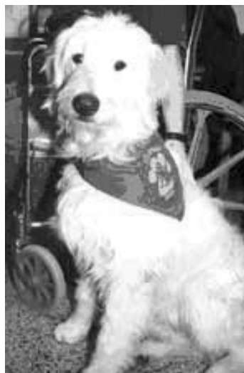
Jack, a schnoodle, is being trained to assist a person who uses a wheelchair. More than 100 dogs have completed the Helping Paws Service Dog Program at Dwight Correctional Center since its May 2000 inception.

“Those involved in Helping Paws see firsthand the success of the program,” said IDOC Director