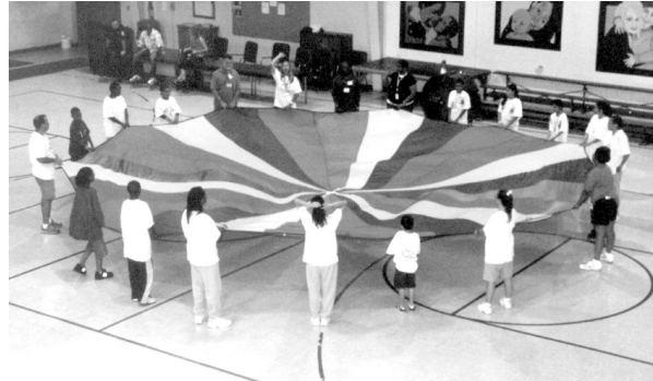
Decatur and Lincoln Correctional Centers hosted their annual Mom and Me Camp where children of incarcerated mothers were able to enjoy crafts and games as well as renew their relationships.

This year, 21 mothers and 29 children enjoyed the camp activities at Lincoln Correctional Center while nine mothers and 12 children enjoyed the same experience at the Decatur Correctional