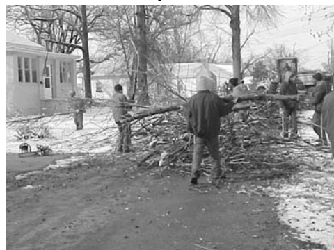
IDOC staff and inmate work crews provide cleanup restoration following the severe ice and snow storm that struck Central Illinois Nov. 30.

The 102 work crews from Vandalia, Decatur, Taylorville, Lincoln, Logan and Southwestern Correctional Centers as well as Green County Work Camp logged in more than 9,250 hours in disaster relief efforts to restore stability to communities affected by the Nov. 30 storm.