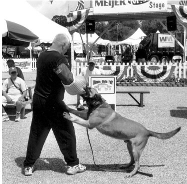
The IDOC K-9 Unit provided daily performances at the Illinois State Fair.

The Illinois Department of Corrections (IDOC) featured a large display located in the Happy Hollow area of the Illinois State Fairgrounds. The fair was held Aug. 11 through Aug. 20. The IDOC display featured the Operation Spotlight Parole Reform Program, the Sheridan Drug Prison and Reentry Program, Women and Family Services programs, Industries, a PowerPoint presentation providing an overview of IDOC programs and more. Performances of the Tactical Team, K-9 Unit and Helping Paws Dog Training Program were held.