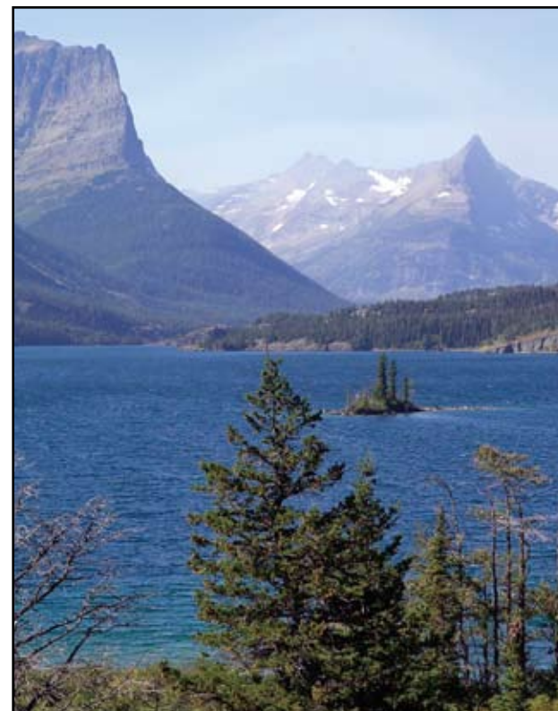
St. Mary Lake