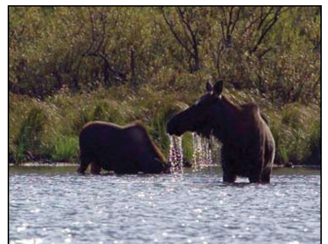
Moose cow and calf at Kootenai Lakes

Note: American citizens, legal residents of the United States and Canadian citizens with proper documentation ONLY, on all hikes leaving from Goat Haunt.