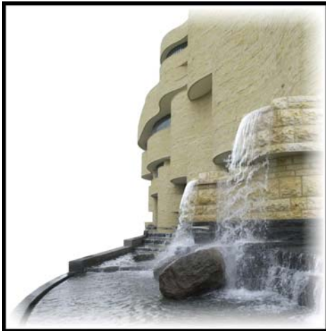
National Museum of the American Indian Washington, D.C.

Higher Education & Student Assistance Programs