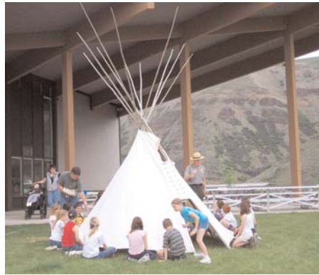
Ranger giving program at Nez Perce National Historical Park Visitor Center. At 9:00 am daily throughout the summer, visitors can help the rangers set up a tipi.

grams and hours, please visit the park's web site at www.nps.gov/nepe .