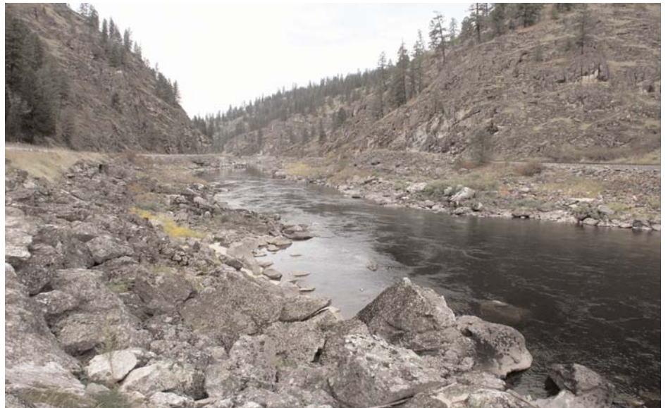
The Clearwater River corridor along US Hwy 12 between Orofino and Kamiah, Idaho. This is part of the Northwest Passage Scenic Byway.