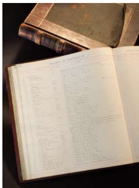
The Red Stack Tugboat Ledgers showing a page from the volume covering 1908-1909.

The bread and butter of her work was in the rapidly expanding oil transport business. Red Stack contracted with Standard