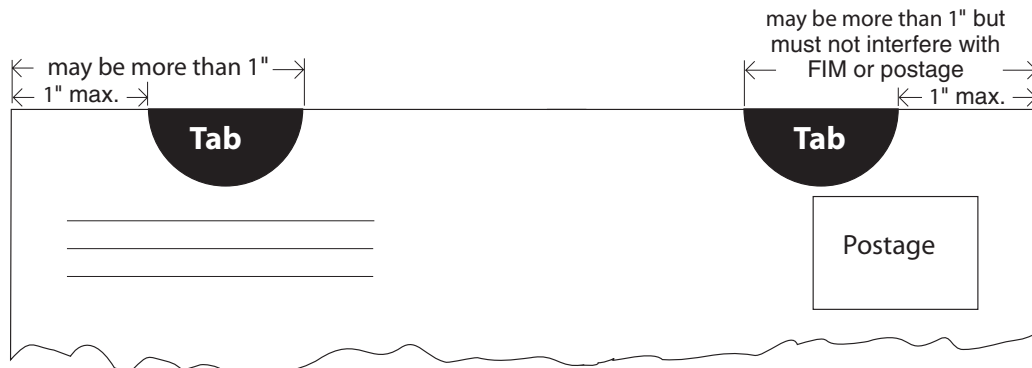
Exhibit 3.14.1b Sealing the Top Edge With Fold at the Bottom