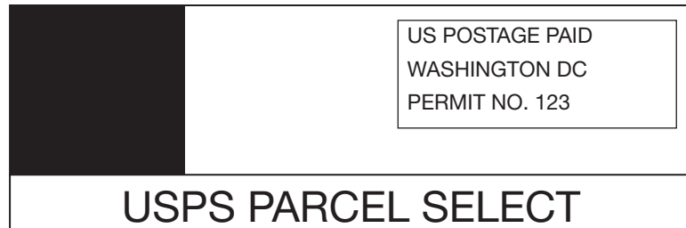
Exhibit 2.2.1 Marking Indicator Examples