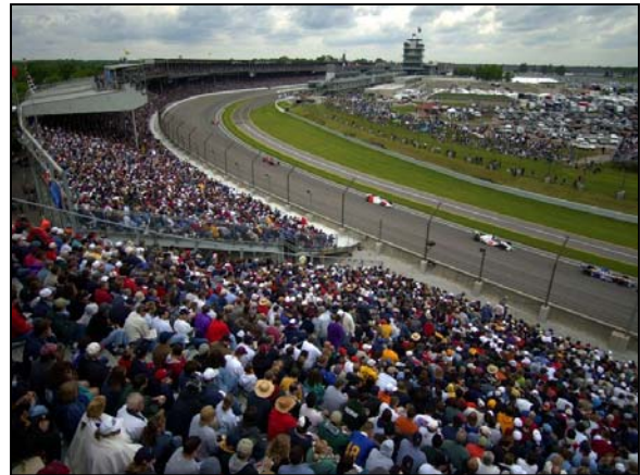
About 400,000 spectators are expected at this year's Indy 500 at Indianapolis Motor Speedway, the 100 th anniversary of the track's creation.

about 400,000 spectators. One hundred years after the first of more than 300 races at the speedway, it remains home of the world-famous Indianapolis 500, as well as NASCAR's Brickyard 400, and some motorcycle and Formula One events. The 93rd Indy 500 on May 24, 2009, is being billed as the first race in the track's "Centennial Era" of 2009-2011. To commemorate this automotive milestone, the Census Bureau has compiled a collection of facts and figures relating to our nation, Indiana and Indianapolis during the past 100 years.