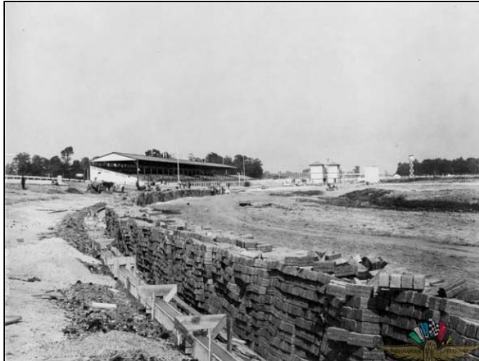
The original tar and crushed rock surface proved to be too dangerous, so the track was covered with 3.2 million paving bricks in the fall of 1909.

< http://www.ssa.gov/OACT/babynames/index.html >