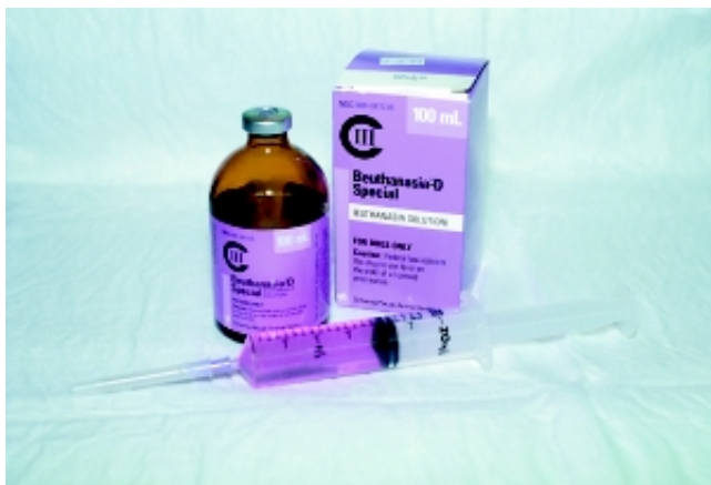
Figure 48.1 The active agent in most injectable euthanasia solutions is sodium pentobarbital.

Circumstances that interfere with burial, such as frozen winter soil or bulky carcasses, result in euthanized carcasses being available for scavenger species. This problem could increase in the future if more stringent air-quality standards restrict carcass incineration.