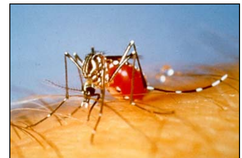
Actual size of an Aedes aegypti mosquito