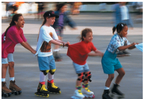
Children active outdoors can be sensitive to some air pollutants.

In large cities (more than 350,000 people), state and local agencies are required to report the AQI to the public daily. When the AQI is above 100, agencies must also report which groups, such as children or people with asthma or heart disease, may be sensitive to the specific pollutant. If two or more pollutants have AQI values above 100 on a given day, agencies must report all the groups that are sensitive to those pollutants. Many smaller communities also report the AQI as a public health service.