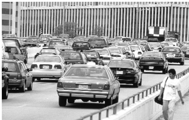
Vehicle exhaust contributes roughly 60 percent of all carbon monoxide emissions nationwide.