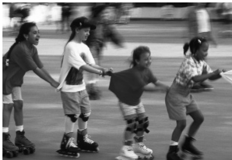
Children active outdoors can be sensitive to some air pollutants.

In large cities (more than 350,000 people), state and local agencies are required to report the AQI to the public daily. When the AQI is above 100, agencies must also report which groups, such as children or people with asthma or heart disease, may be sensitive to the specific pollutant. If two or more pollutants have AQI values above 100 on a given day, agencies must report all the groups that are sensitive to those pollutants. Many smaller communities also report the AQI as a public health service.