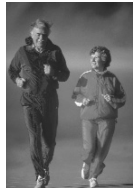
Air quality directly affects our quality of life.

The AQI is an index for reporting daily air quality. It tells you how clean or polluted your air is, and what associated health effects might be a concern for you. The AQI focuses on health effects you may experience within a few hours or days after breathing polluted air. EPA calculates the AQI for five major air pollutants regulated by the Clean Air Act: ground-level ozone, particle pollution (also known as particulate matter), carbon monoxide, sulfur dioxide, and nitrogen dioxide. For each of these pollutants, EPA has established national air quality standards to protect public health.