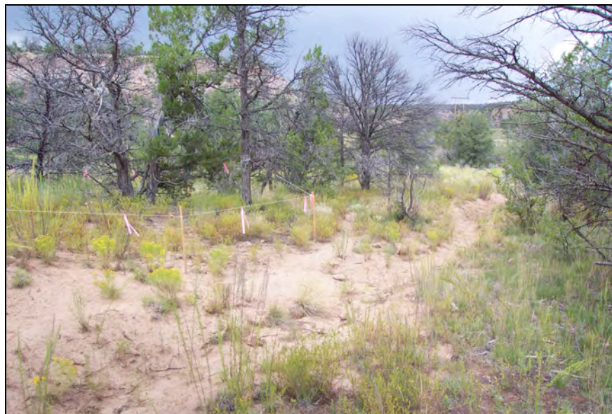
Figure 9. Effects of erosion and trails use at a Coalition period roomblock.

In some portions of the study area no cultural resources were present, however, assessors recommended erosion controls and rerouting of segments due to extreme impacts from erosion (Figure 10). In these areas, further erosion will occur if the trail is not rerouted and could ultimately present a safety issue.