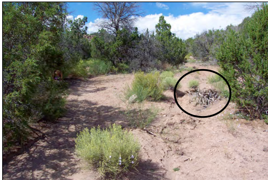
Figure 16. Bypassed portion of a trail segment—area blocked off with tree branches is circled.

Recent tree falls and casual erosion controls have impacted several trail segments. In TA-71, when a tree fell in one area and crossed the trail, users rerouted a portion of the trail and began to use the “bypass” route as an alternative (Figure 16). Bypass routes are sometimes created as horse jumps or to discourage the use of multiple trail segments (Figure 17).