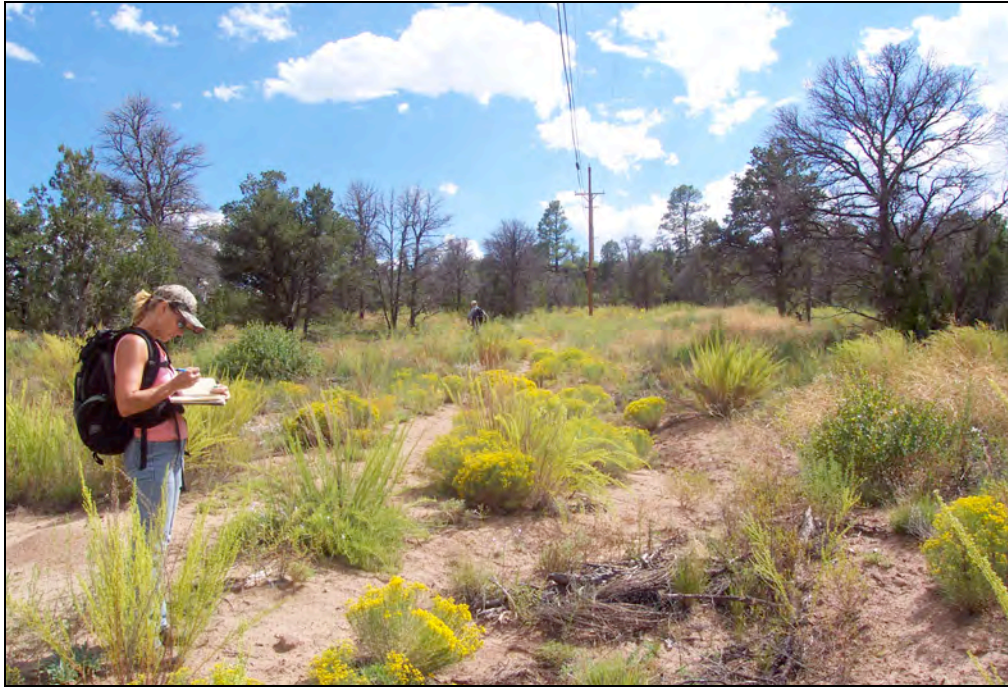
Figure 4. Erosion impacts to a trail segment and a Coalition period artifact scatter.

use and construction of two-track, power line, and fire roads—have exacerbated the impacts of natural erosion. Figure 4 illustrates damage to a trail segment and an artifact scatter resulting from construction of a power line. The effects of erosion can be mitigated to some degree with better land management methods and erosion controls incorporated into LANL projects.