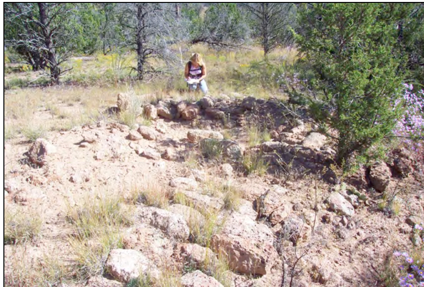
Figure 20. S. Sherwood records impacts to a trail segment and a looted structure.

Assessors suggest that looting at some sites has occurred within the past five years (Figure 20). At one site, looters excavated the center of the structure, pushing masonry blocks out to the sides and removing any artifacts that may have been associated with the site. Removal of the perimeter string will help prevent easy identification and further damage.