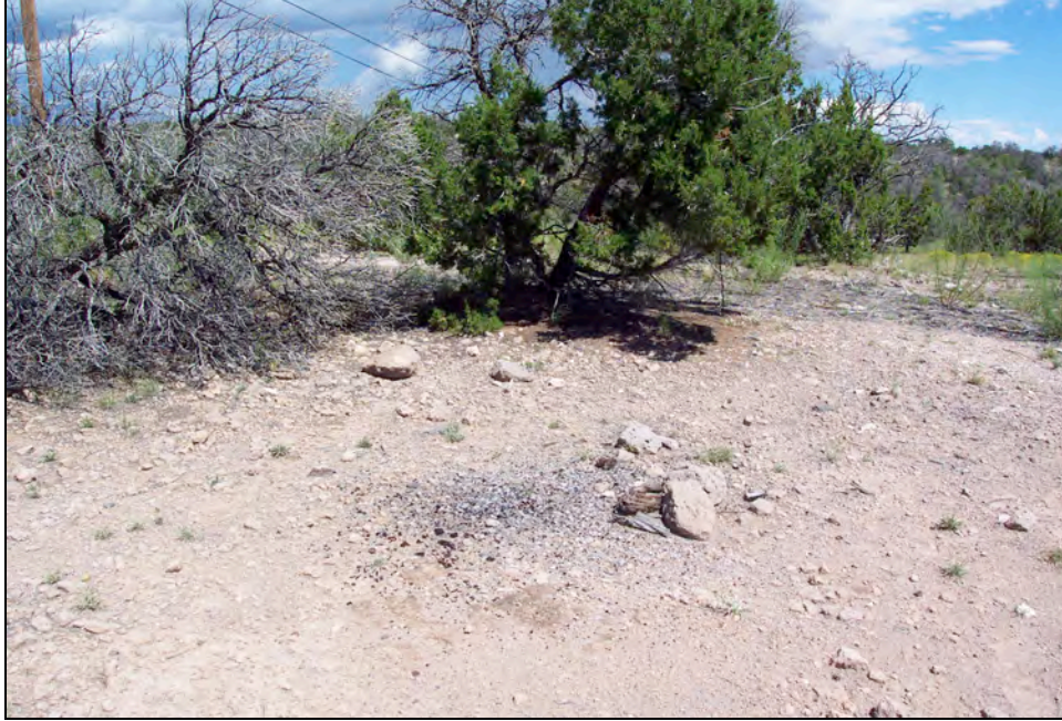
Figure 7. Trail segment and archaeological site with remnants of a modern campfire within the site boundaries.

As previously stated, erosion is the most significant impact to many of the trail segments in this study. A Coalition period one- to three-room structure was affected by erosion directly to the east and west of the site boundary (identified with string and pink flagging tape in Figures 8 and 9). Assessors recommended rerouting trail segments and erosion controls along incised trail segments to protect sites and trail segments from further erosion.