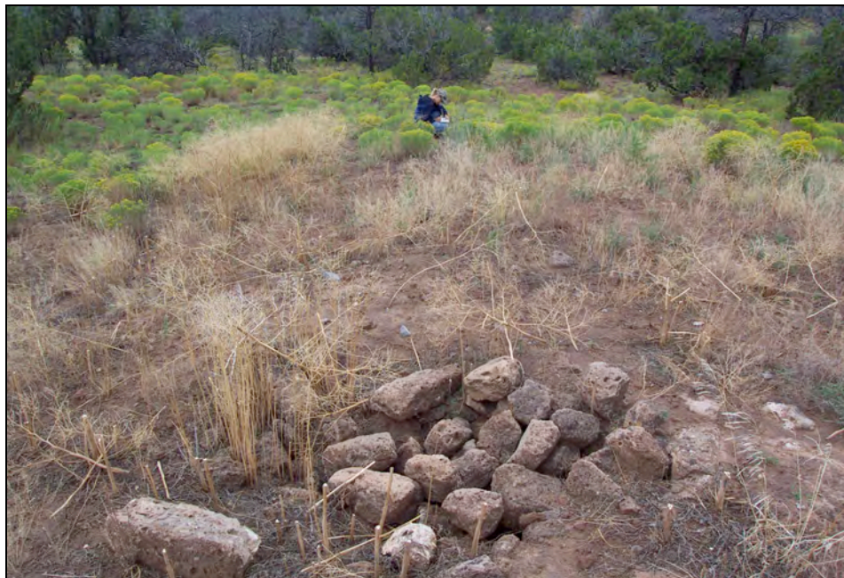
Figure 13. S. Sherwood assesses a trail segment—in the foreground is a cluster of masonry blocks, evidence of looting.

In the areas described in this paper, modern recreational trail segments sometimes intersect ancient trail segments. The age of these trails usually corresponds to degrees of erosion. Age, combined with recreational use, and natural erosion are reflected in a trail's appearance (Figures 14 and 15). In areas where it is possible, assessors recommend rerouting portions of these segments to preserve the Ancestral Pueblo trails.