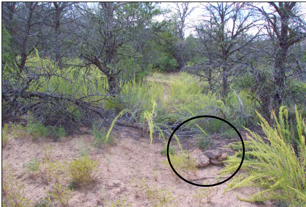
Figure 17. Masonry blocks used to reroute trail segment 14-J after a tree fall.

In almost all cases, assessors recommended removal of the perimeter string from sites with a line of sight from a recreational trail because it appears that artifacts have been collected from the site, as assessors were unable to identify any artifacts on or adjacent to these trail segments. As shown in Figure 18, perimeter string is also recommended for removal because it sometimes impedes natural processes.