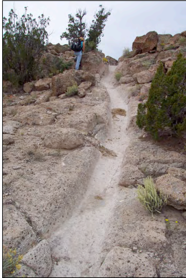
Figure 21. S. Sherwood stands next to an Ancestral Pueblo trail segment.