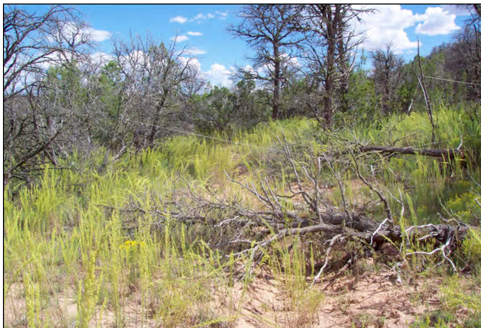
Figure 18. Tree fall on string surrounding site.

In almost all cases, assessors recommended removal of the perimeter string from sites with a line of sight from a recreational trail because it appears that artifacts have been collected from the site, as assessors were unable to identify any artifacts on or adjacent to these trail segments. As shown in Figure 18, perimeter string is also recommended for removal because it sometimes impedes natural processes.