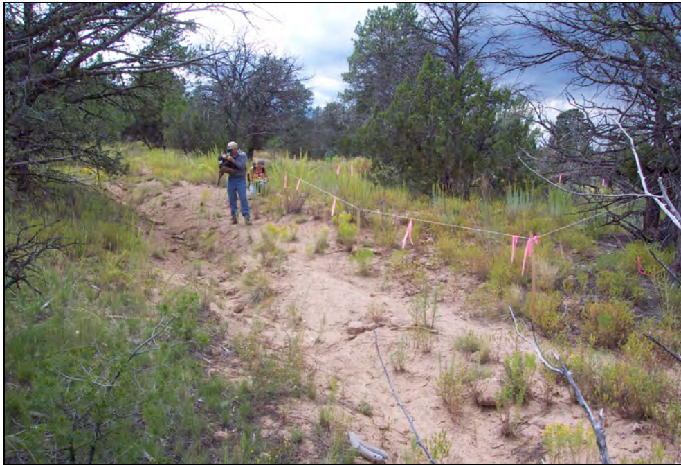
Figure 8. Trail segment and Coalition period site with impacts from erosion.

As previously stated, erosion is the most significant impact to many of the trail segments in this study. A Coalition period one- to three-room structure was affected by erosion directly to the east and west of the site boundary (identified with string and pink flagging tape in Figures 8 and 9). Assessors recommended rerouting trail segments and erosion controls along incised trail segments to protect sites and trail segments from further erosion.