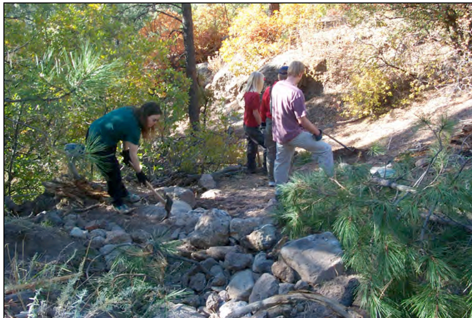
Figure 22. A volunteer work party rehabilitates the historic Hidden Canyon Trail.