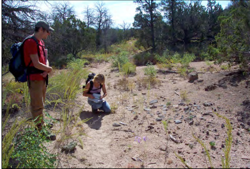
Figure 19. Assessors record a trail segment and two possible roasting pits.

In some cases, assessors identified previously unrecorded sites like the one pictured in Figure 19, thought to consist of two roasting pits next to a well-used trail segment. The roasting pits are relatively ephemeral and, in this situation, assessors recommended excavation of the two features to avoid further deterioration by erosion and trails use.