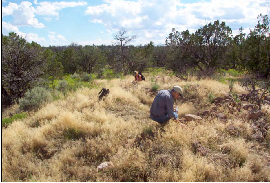
Figure 11. Assessors record impacts to a large Coalition period roomblock.

Some sites have evidence for extensive looting, one such site is a large Coalition period pueblo complex (Figure 12). At the site, two old looters pits appear to have been filled with masonry blocks (Figure 13). Trail segments bisect the site and assessors recommend relocation of the trail to prevent further damage to the site.