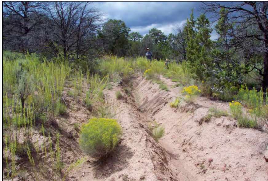
Figure 10. Heavily eroded trail segment.

In some portions of the study area no cultural resources were present, however, assessors recommended erosion controls and rerouting of segments due to extreme impacts from erosion (Figure 10). In these areas, further erosion will occur if the trail is not rerouted and could ultimately present a safety issue.