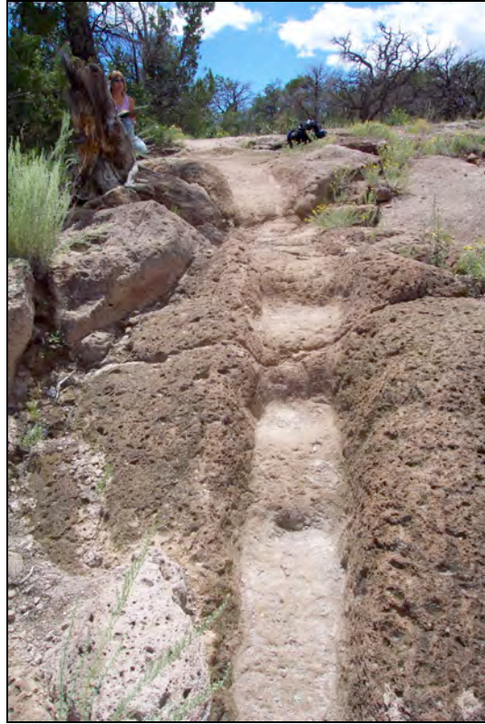
Figure 15. Ancient segment to be closed and the trail rerouted.

Recent tree falls and casual erosion controls have impacted several trail segments. In TA-71, when a tree fell in one area and crossed the trail, users rerouted a portion of the trail and began to use the “bypass” route as an alternative (Figure 16). Bypass routes are sometimes created as horse jumps or to discourage the use of multiple trail segments (Figure 17).