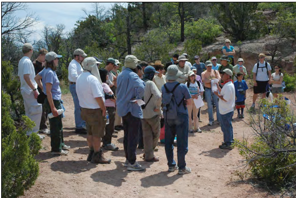
Figure 2. Visitors participate in the 2007 New Mexico Heritage Month tours of Mortandad Cave Kiva trail.