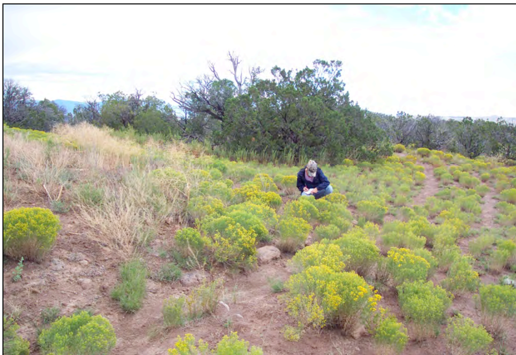
Figure 6. A two-track road runs through a Coalition period roomblock (shaped tuff blocks from the site line the side of the road).

Looting of archaeological sites (Figure 5) has also been an issue in these areas, although it is rare, as recreational trail segments sometimes cross through site boundaries. In most cases, looting activities include manual excavation of Ancestral Pueblo sites resulting in depressions in the centers of masonry rooms and the pushing aside of masonry blocks in an attempt to retrieve artifacts. Disturbance of cultural resources ultimately results in their destruction, as stratigraphic and contextual information is lost when the contents of these sites are ransacked. Recreational trails users and mission-related activities at LANL sometimes impact archaeological resources unintentionally; however, results of these activities are also detrimental to these resources.