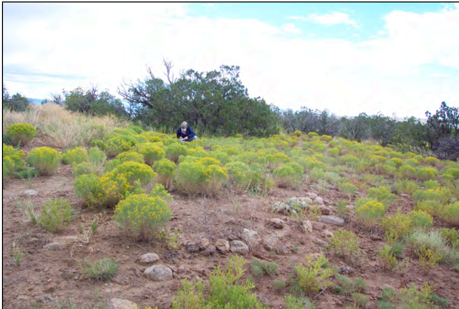
Figure 12. S. Sherwood records impacts to a Coalition period pueblo. Masonry blocks at the bottom of the picture indicate intact archaeological deposits.

Some sites have evidence for extensive looting, one such site is a large Coalition period pueblo complex (Figure 12). At the site, two old looters pits appear to have been filled with masonry blocks (Figure 13). Trail segments bisect the site and assessors recommend relocation of the trail to prevent further damage to the site.