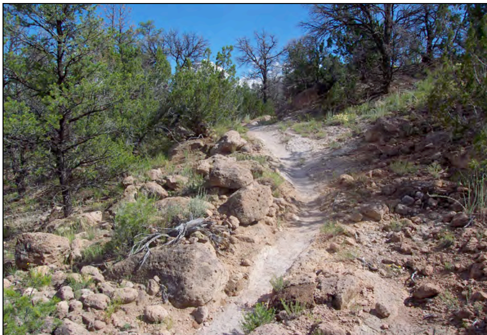
Figure 14. An eroded portion of an Ancestral Pueblo trail segment.

In the areas described in this paper, modern recreational trail segments sometimes intersect ancient trail segments. The age of these trails usually corresponds to degrees of erosion. Age, combined with recreational use, and natural erosion are reflected in a trail's appearance (Figures 14 and 15). In areas where it is possible, assessors recommend rerouting portions of these segments to preserve the Ancestral Pueblo trails.