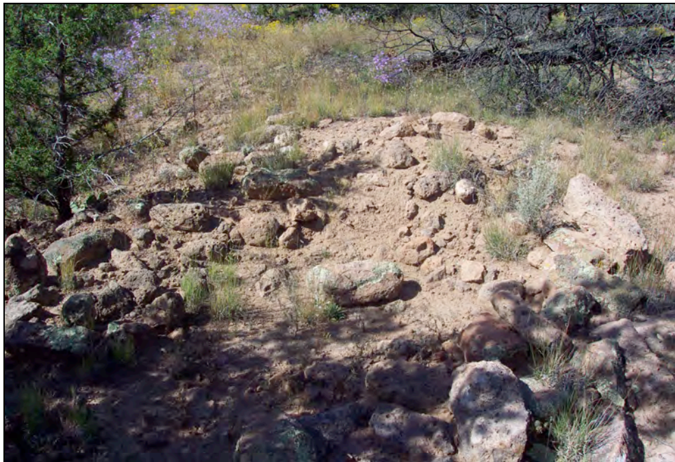
Figure 5. Evidence of looting at a Coalition period site adjacent to a trail segment.