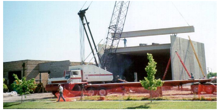
Community storm shelter being constructed to FEMA 361 criteria in Wichita, Kansas.

Design wind speed and wind pressure criteria: Wind pressure criteria are given by different guides, codes and standards. Wind pressure criteria specify how strong the shelter must be. The design wind speed is the major factor in determining the magnitude of the wind pressure that the building is designed to withstand. In FEMA's shelter publications (see Useful Links on page 3), recommended design wind speeds range from 160 to 250 mph. The 2006 International Residential Code and the 2006 International Building Code , which establish the minimum requirements for residential and other building construction, include design wind speeds ranging from 90 to 150 mph throughout most of the country. The table on pages 4–5 provides a comparison of shelter design criteria options. The table on page 6 presents comparative data for two locations using the design criteria presented on pages 4–5.