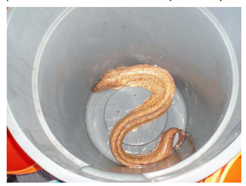
Watch out when there's an eel in your trap! Most of the local species have sharp teeth, and are quick and eager to use them to gain their freedom.

have vessel monitoring systems. But, access for native Hawaiian cultural activities is preserved as several of the islands are ancient holy sites. Midway Atoll retains special