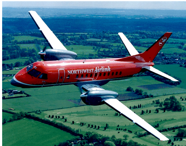
Figure 1. A Saab 340 aircraft operated by Mesaba Airlines.

We will receive these data at NOAA's Forecast Systems Laboratory (FSL), make them available to eligible users in a variety of ways (discussed below), compare them with data from other sources such as radiosondes and profilers, and ingest them into the publicly available Rapid Update Cycle (RUC) data assimilation and forecast system (Benjamin et al., 2004a).