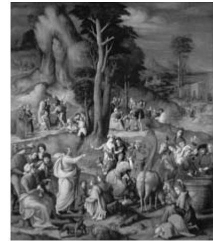
Oil on panel, 59.7 x 43.8 cm (23 1/2 x 17 1/4 in.) Samuel H. Kress Collection 1943.4.33