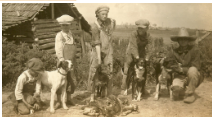
Narrative Report of County Extension Workers South Half of Mississippi County, 12/1/27-1/1/28 Mississippi County South Half; Annual Narrative & Statistical Reports 1911-66; Arkansas; Records of the Extension Service, RG 33, NARA-Southwest Region, Fort Worth, Texas