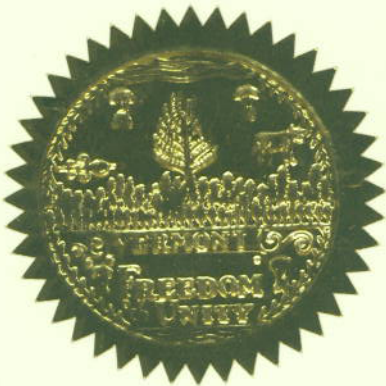
James H. Douglas Governor

Given under my hand and the Great Seal of the State of Vermont this 3 RD day of April, A.D. 2009.