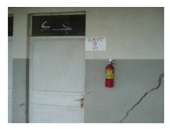
A skull and crossbones sign posted outside of a DDT store room.