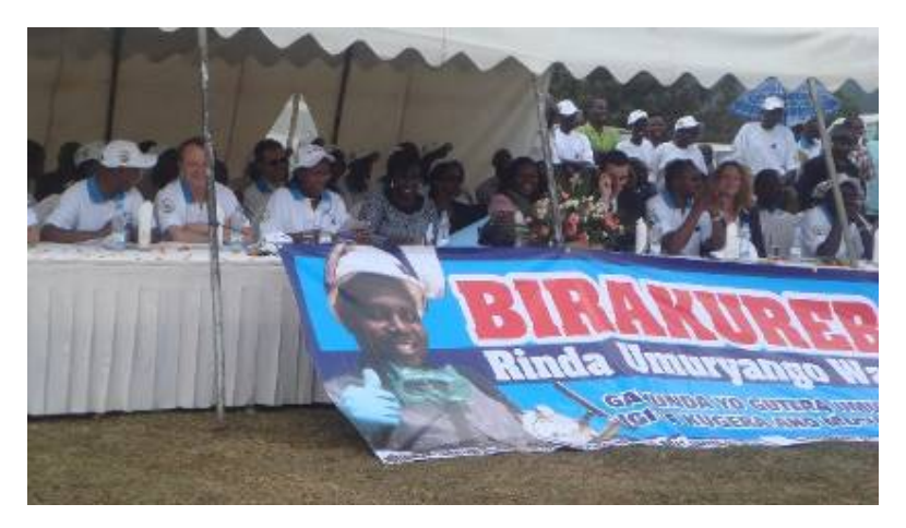
Dignitaries attend the launch of the second round of IRS operations in Rwanda.

The monitoring of spray operations in all districts was carried out jointly by PNILP and IRS TO1. The monitoring helped the IEC team to identify and respond to households that were refusing to participate. Sector Managers and IEC implementers worked with local leaders to increase community participation, and eventually the refusal cases consented to having their houses sprayed.