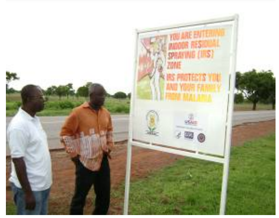
Top: IRS TO1 IEC teams visited schools to inform students and teachers of the purpose of IRS and steps to take before, during, and after spraying. Bottom left: A community soccer game is held to raise awareness about IRS. Bottom right: A sign posted at the entrance to a beneficiary community alerts visitors to the benefits of IRS.