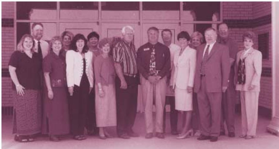
United They Stand— Extension has played a vital part in organizing regional coalitions to attract retirees and tourists to Alabama. One of the most successful coalitions is Southeast Alabama Trails, an outreach effort comprising 11 counties in Southeast Alabama.

The coalition is currently developing a comprehensive strategic plan to guide its outreach efforts during the next decade.