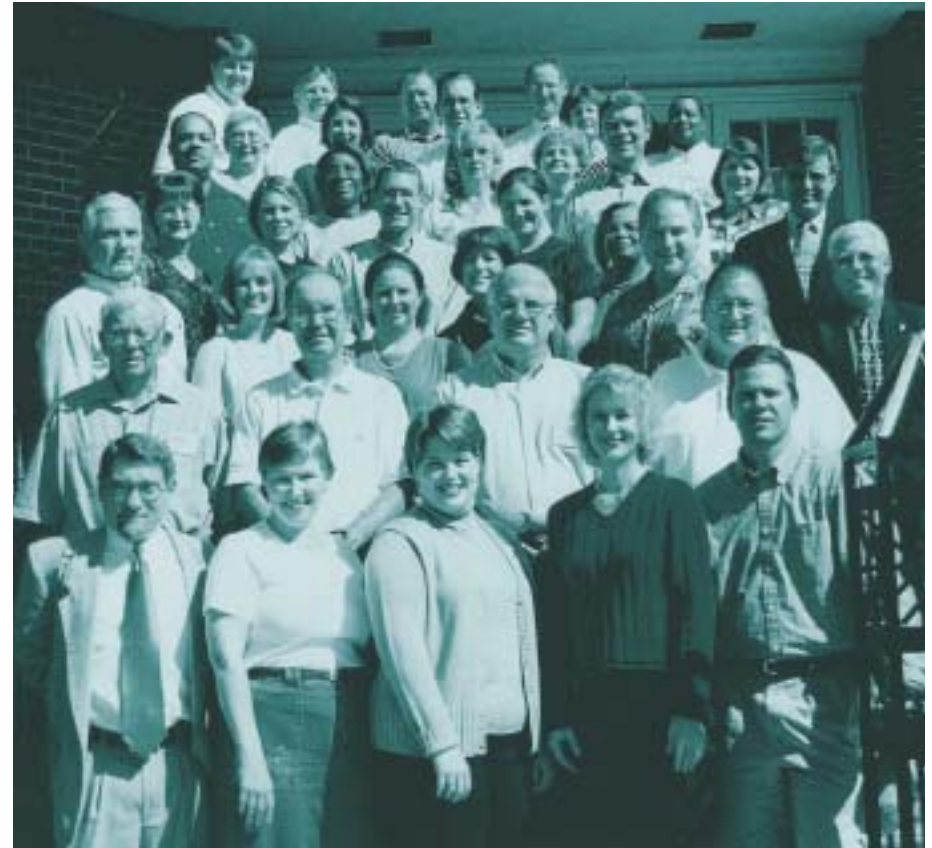
An Intense Experience—The 2001 Intensive Economic Development Course class picture, including instructors. The course is one of the premier economic development programs in the Southeast.

Generous support from four companies—Alabama Gas Company, Alabama Power Company, Alabama Rural Electric Cooperative Association, and BellSouth—enables course planners to provide each class with a topflight faculty comprised of university professors and state and federal economic development experts at a reasonable cost. Alumni from previous classes also share what they have learned.