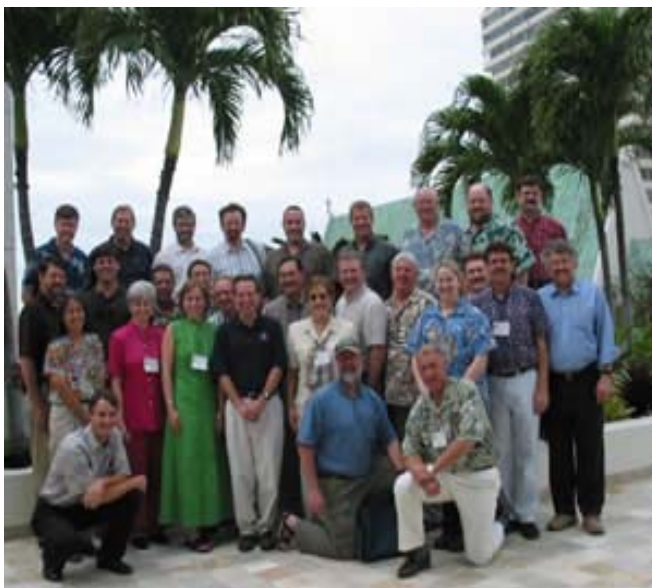
2004 Tsunami Coordination Meeting attendees.

The emphasis was on getting all the key people in the tsunami warning program together. In NWS, this meant everyone from field WCMs to national headquarters. It also meant bringing in key people outside NWS: emergency management officials, primarily state-level, and other government organizations with interest in the program such as FEMA, the U.S. Geological Survey and the NOAA Ocean Service.