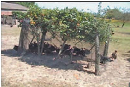
Shade can be constructed.