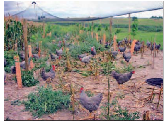
Poultry foraging in a vineyard.