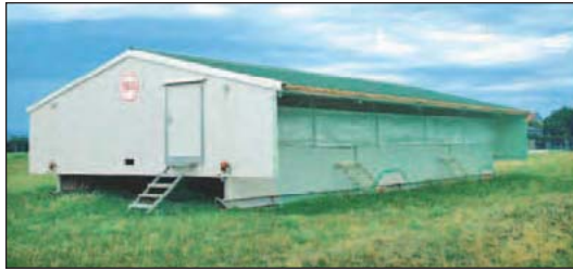
This mobile house has a roofed veranda with curtains that can be lowered in cool weather.