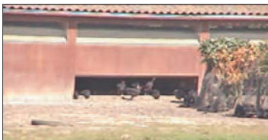
Popholes should be large enough for several birds to exit at a time.

Poultry can be combined with trees in an “agroforestry” setting, such as an orchard or woody ornamentals. A variety of trees, shrubs, understory plants and a pasture clearing will offer a wide range of nutrition, herbs, live protein, and shelter to the birds. Elm Farm Research Centre (28) in the U.K. has planned a poultry agro-forestry system with trees, shrubs, and health-promoting herbs.