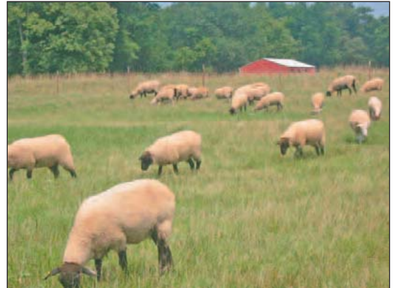
Sheep can be integrated with free-range poultry and help to control the forage for poultry.

vegetable production in “permaculture” systems that integrate principles of natural systems with agriculture. Some organic programs require that at least 50 percent of the poultry feed come from the farm where the birds are raised—or a nearby farm—in order to keep the nutrients cycling in the same region. Diversified farms allow nutrients to be recycled between plants and animals.