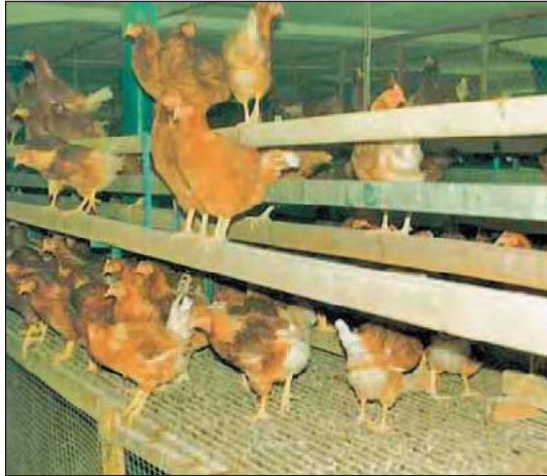
Hens have access to multiple levels and scratching areas in aviaries.

Aviaries are specialty, multi-tiered buildings for cage-free layers that provide several levels of flooring and use vertical space (perches and platforms) to allow birds to jump to different levels. Aviaries can actually maintain a high density of hens.