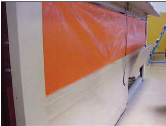
This French house is portable. It has no floor but uses litter and has automated feeding equipment.