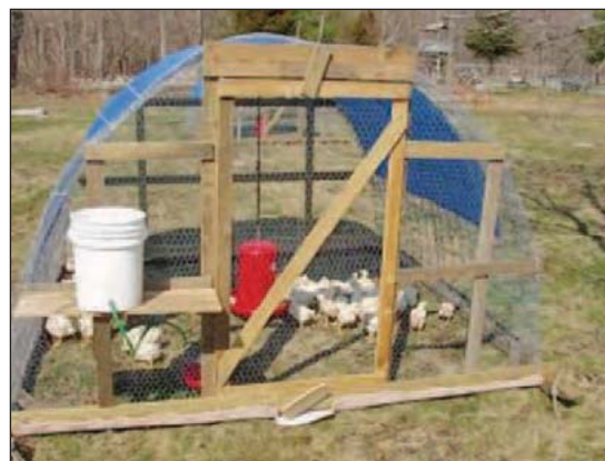
Hoophouse pens are popular.

The basic pen design can be modified in many ways. Plastic (PVC) pipe and rebar have been used in place of wood to lighten the structure. However, in areas with strong winds, light pens need to be staked down.