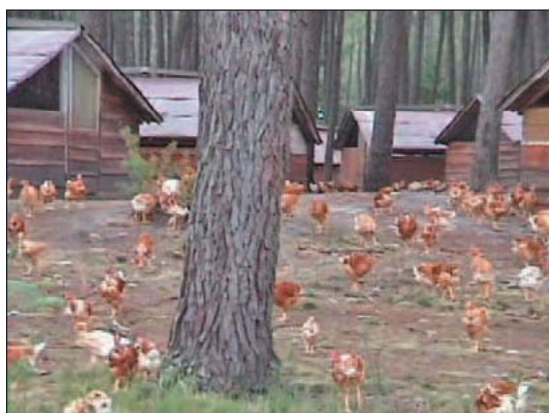
Free-range chickens foraging in a forest in France.

Poultry may share pasture with cattle, sheep, and goats. The pasture soil is improved by the poultry’s rich manure which helps revive fertility on a farm. Several species of animals may be grazed simultaneously, or the grazing may be staggered to allow only one species at a time in the paddock. Multi-species grazing can aid in protecting poultry from predators that respect large animals. Sheep in particular can help manage the forage for poultry. However, cattle and goats may disturb poultry housing and feed. Cattle may not have experience with poultry netting and may bring it down by accident. Exclude ruminants from poultry feeding areas to prevent foundering from overeating grains. Also, poultry feed may have additives not appropriate for ruminants.