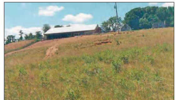
Poultry can even cause erosion.