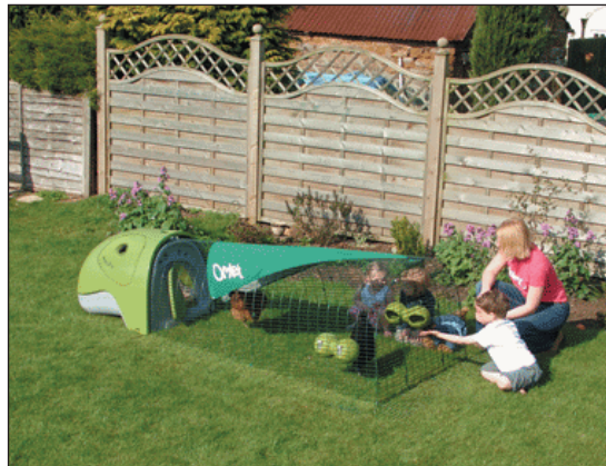
Urban producers often use small pens with attached houses.

P oultry species should not be mixed, nor should flocks of different ages comeingle.