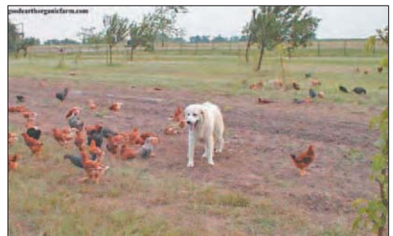
Guard dogs can protect poultry.

According to Vermont producer Walter Jefferies, “At issue is how many protectors are in the guardian pack. A single dog or llama, doesn’t cut it with serious predation—several are much better as they can work as teams. A pair or pack of guardian dogs will successfully protect against almost anything short of the marine corps. Two do a bear. Three a cougar...Dogs alert us to threats, mark territory in ways that predators understand and respect...By their nature dogs are hunters at the same time of day that predators are at their greatest threat since the dogs are semi-nocturnal. Dogs are also useful for disposal of proteins (slaughter remnants) that I don’t want to feedback to our various flocks (pigs,