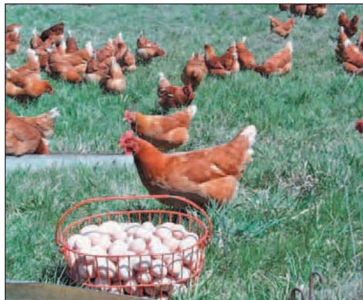
Outdoor access is an important part of most alternative poultry production systems.

Alternative poultry production is growing due to consumer demand for specialty products from cage-free and free-range birds. This publication discusses the differences between alternative and conventional production systems. Alternative production systems vary according to size but, in some countries, are standardized by specific definitions to assist in marketing. The various aspects of free-range systems in the U.S. and abroad are presented. Common poultry housing approaches are also discussed. Integration of poultry production with crop production on a diversified farm is an important part of sustainable agriculture, and birds can be integrated with vegetable production (“chicken tractor”) and with grazing livestock, such as sheep. Organic poultry production is a type of alternative poultry production that is currently enjoying a growing market. Considerations surrounding organic production are presented. Production topics such as outdoor access and pasture management, pasture rotation, and predator control are also discussed.