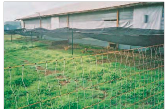
A fixed house and yard.

O utdoors, stocking density is used to maintain vegetation and reduce pathogens and excess nutrients.