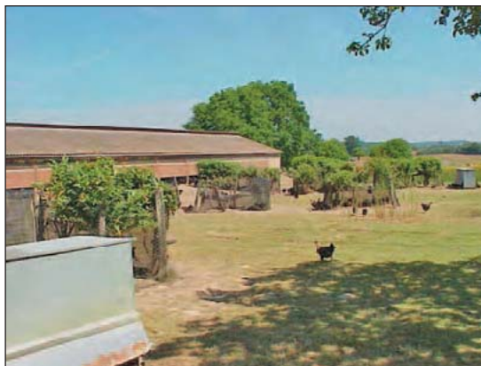
Shade is crucial in outdoor areas for poultry; wide open fields are not preferred habitat.

The chicken evolved from a ground dwelling forest fowl that inhabited tropical forest clearings and woodland edges and roosted in trees at night. (27) As flightless birds from the jungle, they need protection and shade outdoors, such as trees and bush plantings. In fact, they may not venture outdoors without it. Chickens do not like full sun, strong winds, or overhead predators. European research has shown that birds will forage in the open but prefer a covered area for resting. (1) Some free-range programs in Europe require shade/shelter in outdoor areas. Trees and bushes are multi-purpose, providing shade, roosts, overhead cover, and a wind break. Man-made constructions can also be used, including roof overhangs, walls, tarps and shade panels, portable “wigwams,” and strawbales with pallets on top. Tarps on wheels provide portable shade and keep manure from collecting in concentrated areas. Tall crops such as corn or sunflowers can also be planted to provide shade and additional feed. Sometimes poultry are raised close to corn fields so birds can range among the tall plants.