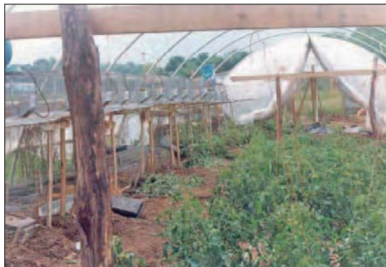
Salatin overwinters layers and other small livestock in a hoophouse which in spring is used to start early vegetables.

animals are removed, the hoophouse is used for early vegetable production. Salatin uses double layers on the hoophouse—a shade cloth and a clear tarp. The shade cloth can be removed to capture solar energy during winter. Salatin makes his buildings multi-purpose in order to rotate species in them.