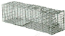
A live trap.

Some producers live trap predators and may then kill the animal humanely. Problem animals can be relocated, but they may become a problem for another producer. The following web site sells humane traps www.pestproducts.com/humane_live_traps.htm .