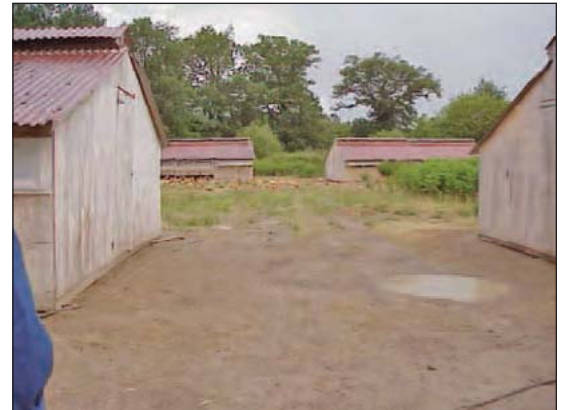
Avoid low areas where water can puddle.

Land should drain well and should be mainly covered with vegetation. Land with low spots may be a problem in heavy rains, and poultry may be exposed to pathogens and parasites if they drink from dirty puddles. However, waterfowl need access to bathing water. For certified organic production, there should be no synthetic chemicals applied to the land for three years. (9)