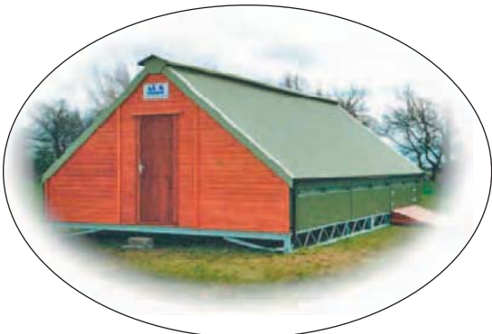
An attractive free-range house in the U.K.

For many attractive designs for small poultry houses used for free-range production in the United Kingdom see www.forshamcottagearks.co.uk Web site.