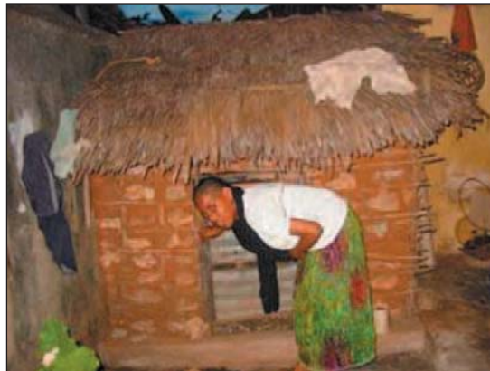
Indoor production is also done on a small scale in developing countries. www.bridgesweb.org

Indoor. The large-scale conventional industry raises broilers in houses. They are raised on the floor on litter, usually at a stocking density between 6.5 to 8.5 pounds per square foot (7), which is less than 1 square foot per bird. Sometimes birds are provided with additional space and marketed on the basis of having extensive space indoors.