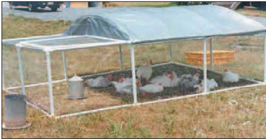
A pen built from plastic pipe.

No litter is used so birds can forage for grass and the pen is moved daily. The daily moves control coccidiosis, a parasitic disease that occurs if birds are in contact with their own manure. Salatin advises to return to the same plot of land only once per year.