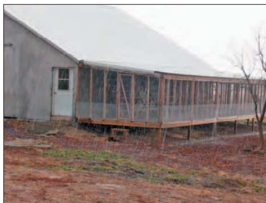
A screened porch with a mesh floor.

Ideally, yards are covered with vegetation but sometimes are simply dirt scratching or exercise areas. Ground coverings such as gravel, straw, mulch, or sand are preferable to a dirt lot and help reduce mud. The area may even be completely or partially covered with a roof, making a veranda. Screens may be used to enclose the birds in a “winter garden” or curtains can be used. This allows access to sunlight and fresh air while protecting birds from weather and wildlife. In some cases, a screened porch with a mesh floor allows manure to pass through so it can be collected and removed.