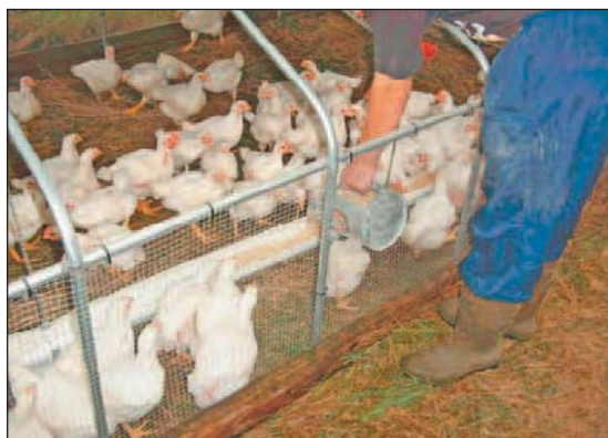
This “versashelter” or pasture pen is not only used for poultry production; it is also a cold frame for starting vegetables.