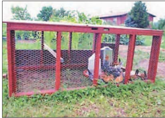
Poultry in a "chicken tractor" improve garden beds by scratching, insect control, and weed control.

will leave a sheet-mulch on top of the beds to kill grass and weeds. According to producer Jean Nick, heavy broilers don't really till the soil. "They just poop and stomp on it." Layers are better at clearing weeds and bulbs and scratching the ground.