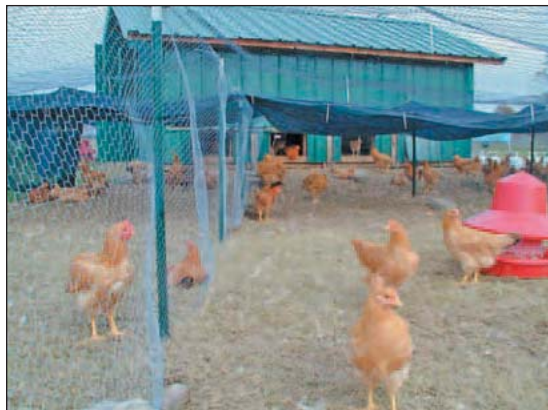
Poultry need feeders and waterers in outdoor areas as well as indoor.

Birds need the same services outside the house as inside. They should have access to feed and water outside so they do not have to return inside. Feeders should be protected from rain and wildlife with a shield or cover and should be easy to move to a new location. Birds also need access to shade and shelter so they don't run back to the house every time something flies overhead. (2)