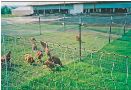
Subdividing the yard of a fixed house permits pasture rotation and rest. The use of bird netting on top can reduce contact with wild birds.

Many producers permit outdoor access to improve not only bird welfare but also health; however, there are concerns about birds getting diseases from wildlife. In times of extreme heightened biosecurity, birds may be temporarily confined. At the time of this writing, avian influenza is a concern, and in Europe, many free-range flocks have been confined to prevent contact with wild birds. Take measures to reduce direct contact between domestic poultry and wildlife. Keep wild birds out of range feeders so they won't eat from them or defecate in them. The Soil Association suggests a container with small slits that allows poultry to pick out only a few grains or pellets at a time. Netting over range areas reduces contact with wildlife, and covered areas can eliminate contact. Biosecurity for the Birds (38) is a USDA project that provides information for small poultry producers on how to maintain good biosecurity.