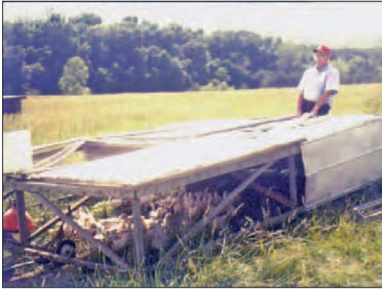
Pasture pens are moved daily to fresh pasture.