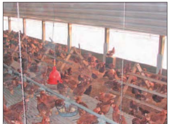
Cage-free hens are free to scratch and roost.

Cage-free. Cage-free layers are raised loose on a floor, which is generally covered with litter to absorb manure and allow birds to scratch. Eggs from cage-free layers are sometimes called “cage-free” or “barn eggs.” Maximum stocking density should be no more than one bird per 1.5 square feet, but can be increased up to 1.2 square feet with slats and multiple levels of flooring on litter. (5) Slatted floors permit a higher stocking density since birds roost on the slats at night, droppings fall into a pit below, and less manure accumulates in the litter. However, some programs limit the amount of slats that can be used in the house in order to ensure birds have sufficient solid floors with litter for scratching.