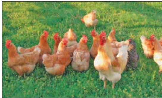
Outdoor access or “extensive” production allows poultry to express natural behaviors, provides sunlight and fresh air, and a healthy environment for the birds.

Outdoor access allows poultry to express natural behaviors. Birds scratch, pursue insects, eat forage, and dust-bathe outdoors. Outdoor access provides more space and is called “extensive,” which may reduce stress because the birds are less crowded. Direct