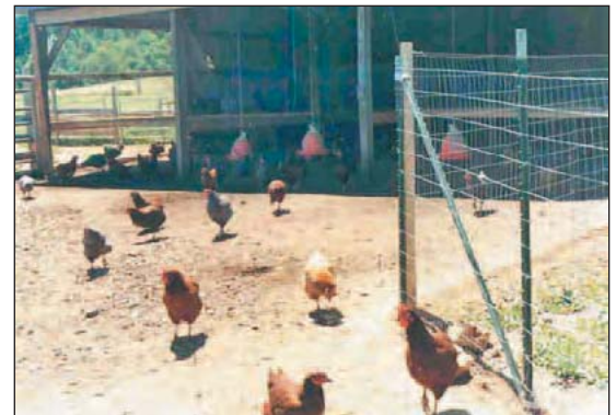
Poultry damage vegetation in a permanent yard.