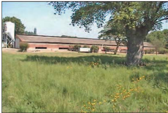
Free-range production is done either on a large or small scale.

Free-range. The U.S. Department of Agriculture (USDA) does not currently have specific regulatory definitions for “free-range,” although the term is allowed on labels under certain circumstances. When applying for label approval, the producer must submit a brief description of the housing, which the