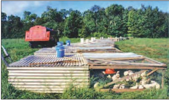
Pasture Pens.