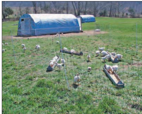
A portable hoop house.

P asture pens are set in a pasture, on a lawn, or in a garden. They are a favorite of small-scale producers due to their low cost and flexibility.