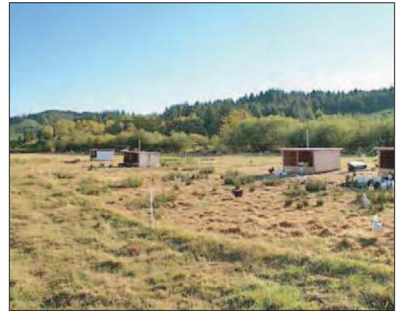
Plamondon’s colony system has a central nesting house grouped with four small roosting houses.

(or, in the past, horse). According to Plamondon, when you have more eggs than you can carry by hand, you need a nest house. Plamondon’s roost houses do not use floors or litter, although nesting houses have litter to clean birds’ feet. When he moves the house, there is a 2 to 4-inch layer of manure left which he scrapes with his tractor and incorporates into the pasture. The houses should be kept 300 feet from barns, garages, and other places where you don’t want birds to roost. He keeps 50 hens in each small house, and his colonies consist of 200 hens each.