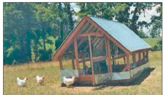
A portable shelter with a floor.

The use of small shelters on skids is described in Free-Range Poultry Production and Marketing by Herman Beck-Chenoweth. (12) His shelters have a roof and a wood floor covered with litter but only chicken wire instead of walls. He moves the shelters to fresh pasture every four weeks