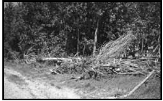
Properly planned, waterbreaks can effectively trap flood debris.