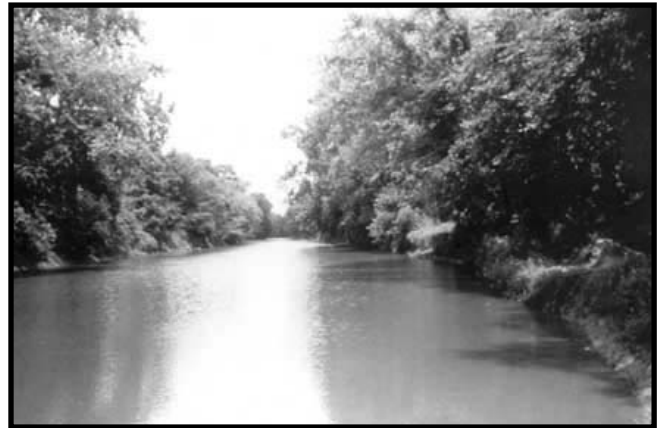
Trees along this streambank will effectively control bank and surface erosion.

In addition, complex ownership patterns may require group planning for proper waterbreak design, function, use, and management.