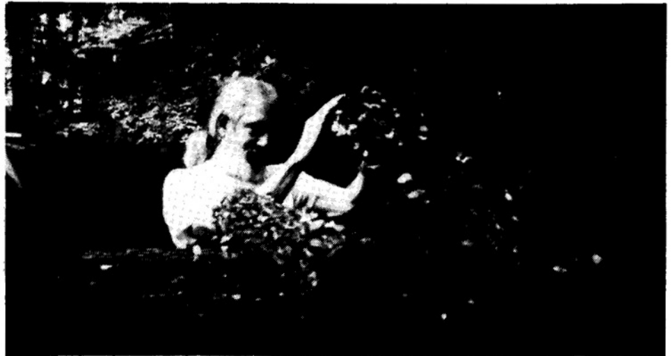
A Summertown, Tennessee mushroom grower examines shiitake-producing logs.