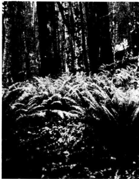
Gathering of swordfern fronds dates from the turn of the century. Today it is harvested year-round from shaded forest areas.

Because of increased restrictions on access to the forests where specialty products can be found, there has been a growing interest in producing SFP in agroforestry systems -- in other words, farm the forest. “Forest farming” is the intentional culture of specialty crops in a managed system. Many SFP's have tremen-