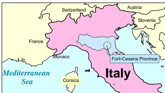
Figure 3. In June the European Commission announced that the Italian province of Forlì/Cesena had lost its SVD-free status due to recent outbreaks of the disease.

2. European Commission fax #33. June 6, 2008.