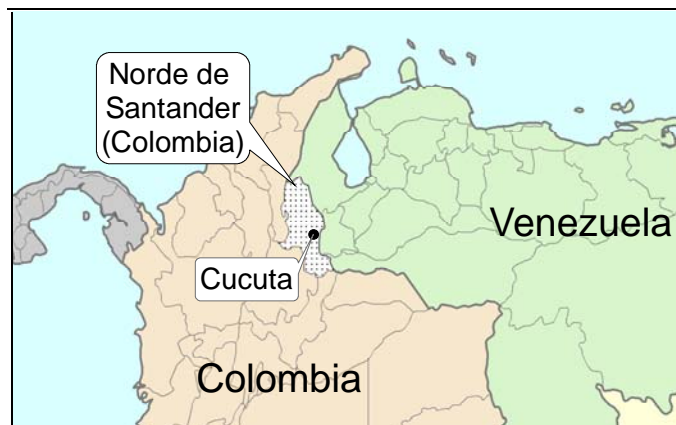
Figure 1. In May an FMD outbreak was reported in a herd of cattle in the city of Cucuta in Norte de Santander department, Colombia, near the border with Venezuela.

On May 30 Colombia's National Health Service reported an outbreak of foot-and-mouth disease (FMD) to the OIE. The outbreak occurred in a herd of cattle in the city of Cucuta in Norte de Santander department (Figure 1). The affected premises is located 4 km from the Venezuelan border and within an existing surveillance zone maintained by Colombia. Twenty-nine of 188 head of cattle presented with lesions and 27 of 30 tested cattle were found FMD-positive. Three additional outbreaks involving a total of 46 head of cattle were reported to the OIE on June 17. All of the subsequent outbreaks were within the vicinity of the index farm. Prior to the current outbreak, Colombia most recently reported FMD to the OIE in 2005 when a laboratory strain infected cattle at a research station in Bogota.