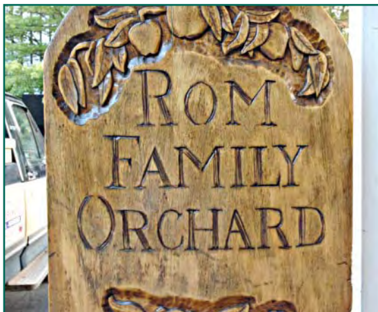
An artistic hand-crafted sign identifies this vendor's spot.

The farmers' market issue of Growing for Market can be downloaded from the website www.growingformarket.com . And Buczynski's new book, Market Farming Success , has an excellent section on farmers' markets. See Additional Resources .