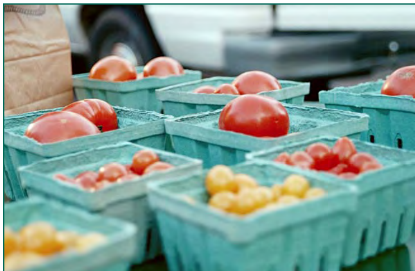
“SalsaFest” tomatoes at the Fayetteville, AR, Farmers’ Market. Everyone is happy when local tomatoes ripen.