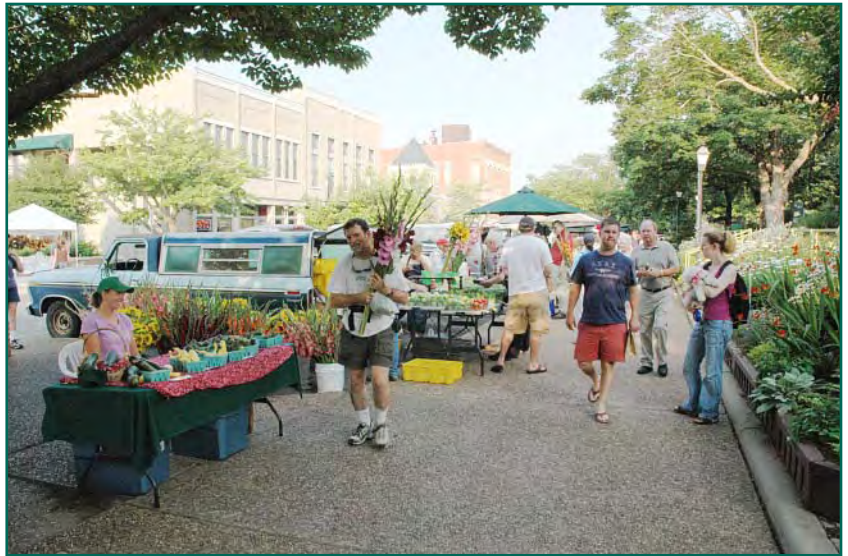
A beautiful location is an advantage.