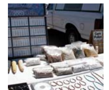
Selling corn products