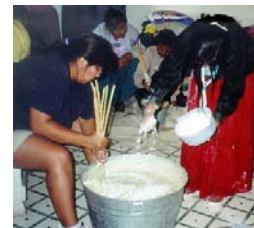
Mixing a cake

Another part of the project was to initiate a community kitchen feasibility study. A consultant specializing in community kitchen feasibility traveled to Ganado to assess the potential for developing such a kitchen.