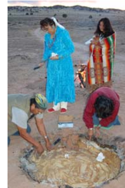
A Navajo cake, fully cooked, being cut from the pit.