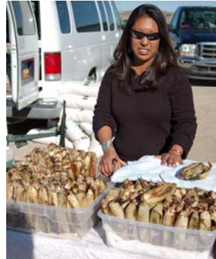
Kneel-down bread, shown here, is similar to a tamale and is sold at local flea markets.