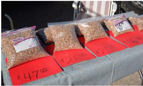
Dry steamed corn products at a local market

From a previous Western SARE Farmer/Rancher Grant conducted by project coordinator Teresa Showa, a Navajo small farmer's booklet was developed as a marketing resource guide on Navajo Traditional Corn Products. These products are culturally important and nutritionally superior to much of the food currently available and consumed on the reservation.