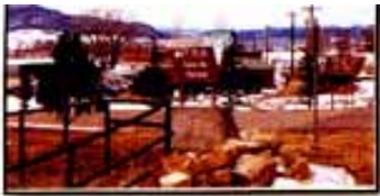
Meeker BLM Entrance