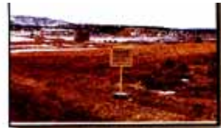
Tom Brown Inc. Oil Pad