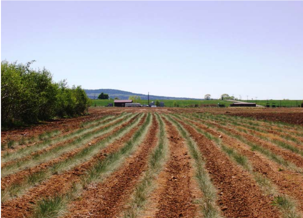
Indian Ricegrass May 16, 2006