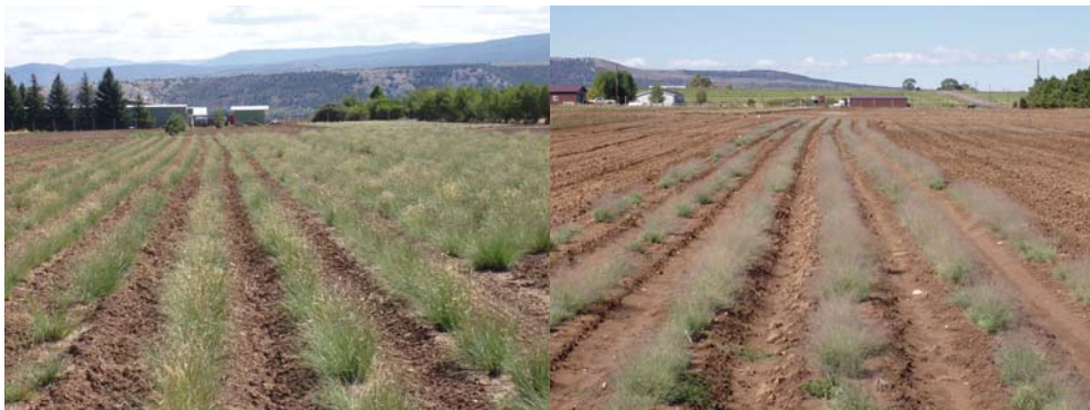
Blue grama & ring muhly on August/September, 2006