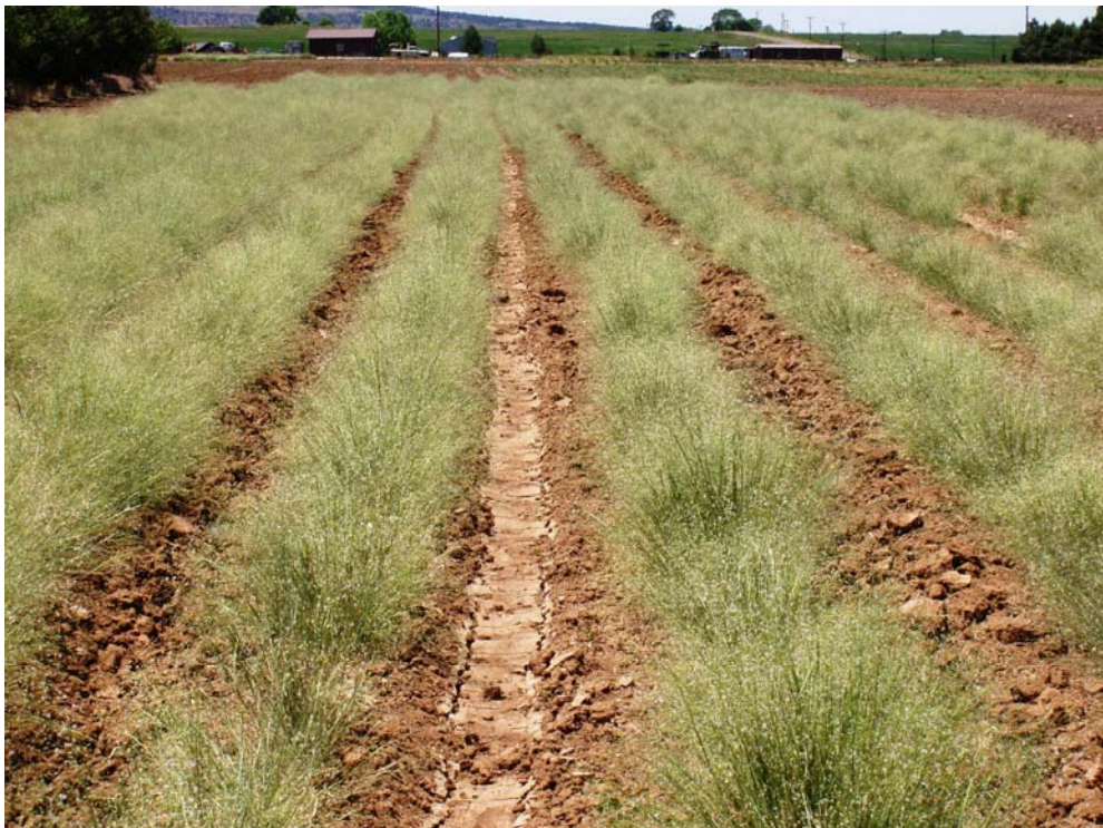
Indian ricegrass June 2006