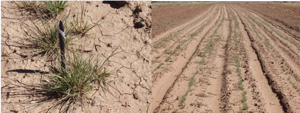
Blue grama & ring muhly on September 25, 2005