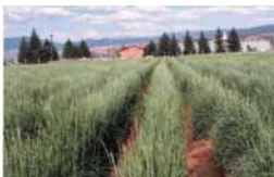
'San Luis' Slender Wheatgrass