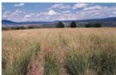
'Arriba' Western Wheatgrass

The Upper Colorado Environmental Plant Center (UCEPC) is a non-profit facility owned and operated by two soil conservation districts in northwest Colorado. The 269 acre center is located at an elevation of 6,500 feet with 16 inches of annual precipitation and a 90 day frost free growing season. Our service area includes mountains, deserts, and plateaus of the Rocky Mountain west.