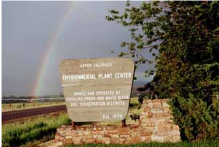
The UCEPC, located in the beautiful surroundings of Meeker, Colorado.