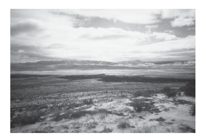
Figure 1 —Rangeland near Maybell, CO. The dark vegetation across the center of the photograph is a remnant unburned stand of bitterbrush.

The research site is dominated by bitterbrush in unburned areas. Other shrubs associated with bitterbrush are big and silver sagebrush, gray horsebrush, and low and rubber rabbitbrush. These shrubs are now abundant within the burned areas. The principal grasses are Indian ricegrass, needle and thread, sand dropseed, and Sandberg bluegrass. Cheatgrass is a dominant weed in burned areas.