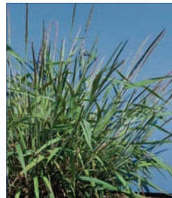
'Arlington' and 'Elkton' blue wildrye

A PMC release is a plant selection that has been evaluated and selected for its ability to grow under certain conditions while achieving specific conservation purposes, such as erosion prevention, invasive species control and other functions.