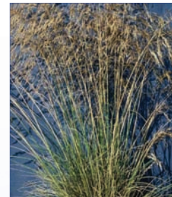
'Willamette' and 'Tillamook' tufted hairgrass

Native grass: used for woodland revegetation, upper streambank and roadside stabilization, erosion control on disturbed sites, quick cover, site rehabilitation after logging or fire and wildlife habitat.