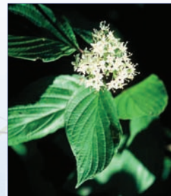
'Mason' western redosier dogwood

Native germplasm: applications include riparian revegetation, shoreline erosion control, freshwater wetland plantings and wildlife cover and herbage.